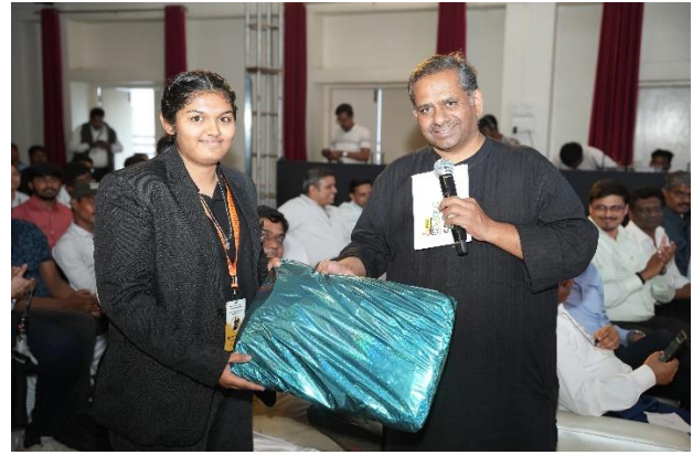
Awarded from Students ( Audience)