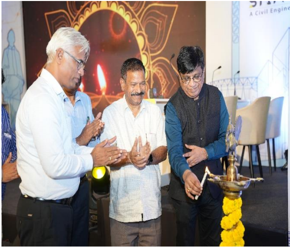
Inauguration and Lamp Lightening