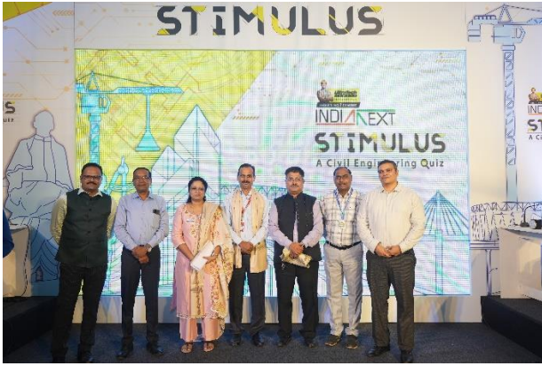
Felicitation of Other College Heads