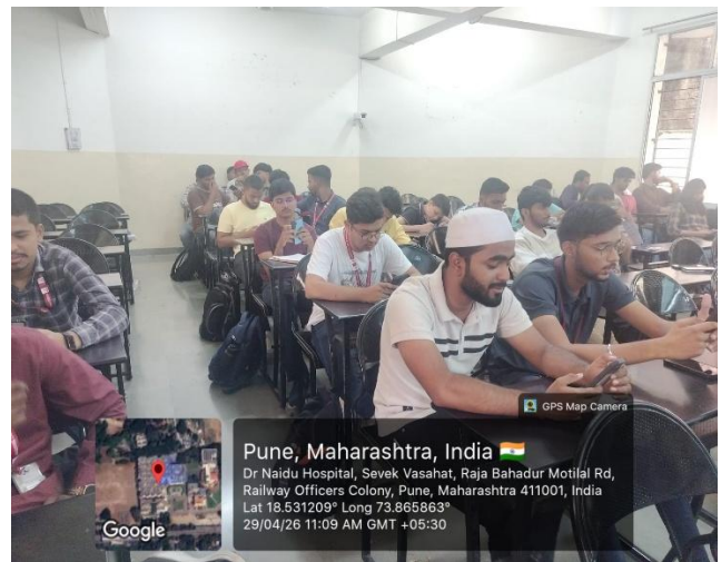
Students participating in the quiz competition