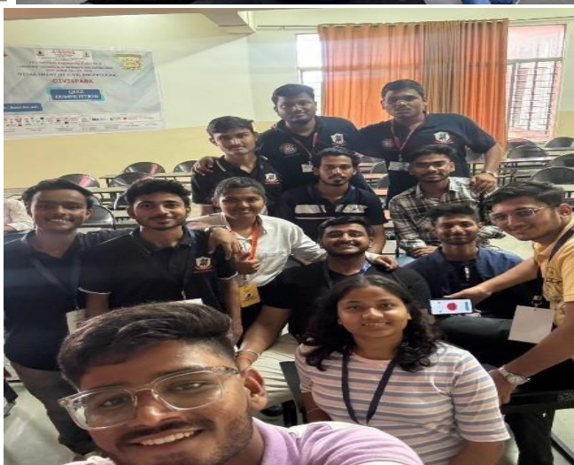
Glimpses of Quiz competition

Name of the Event: CV2: Poster Making Competition