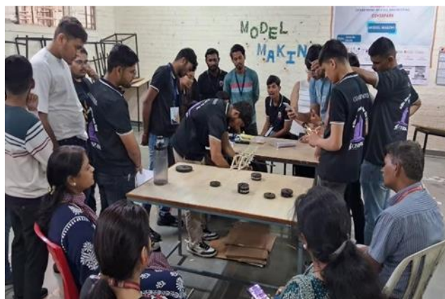
Glimpses of model making competition