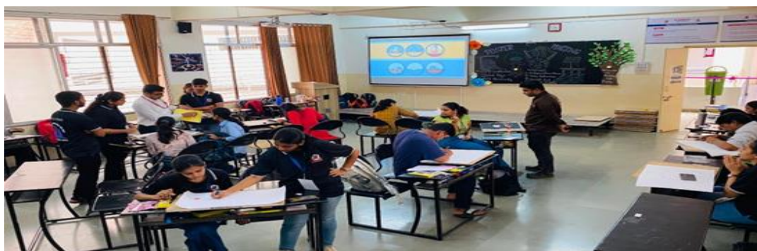
Glimpses of Poster making competition