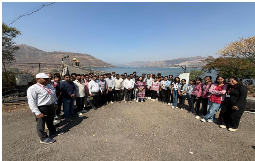
Site visit for B E at Dimbhe dam