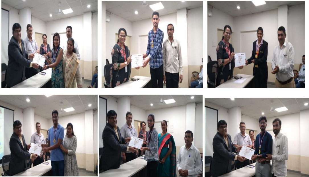
Distribution of Certificate and Medals to Class Toppers