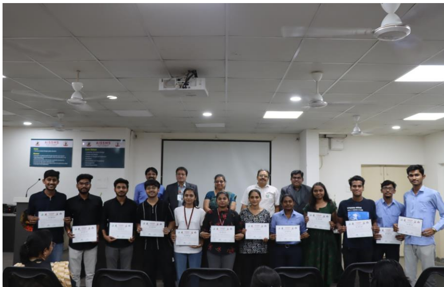
Winners of Rail Geofest Event