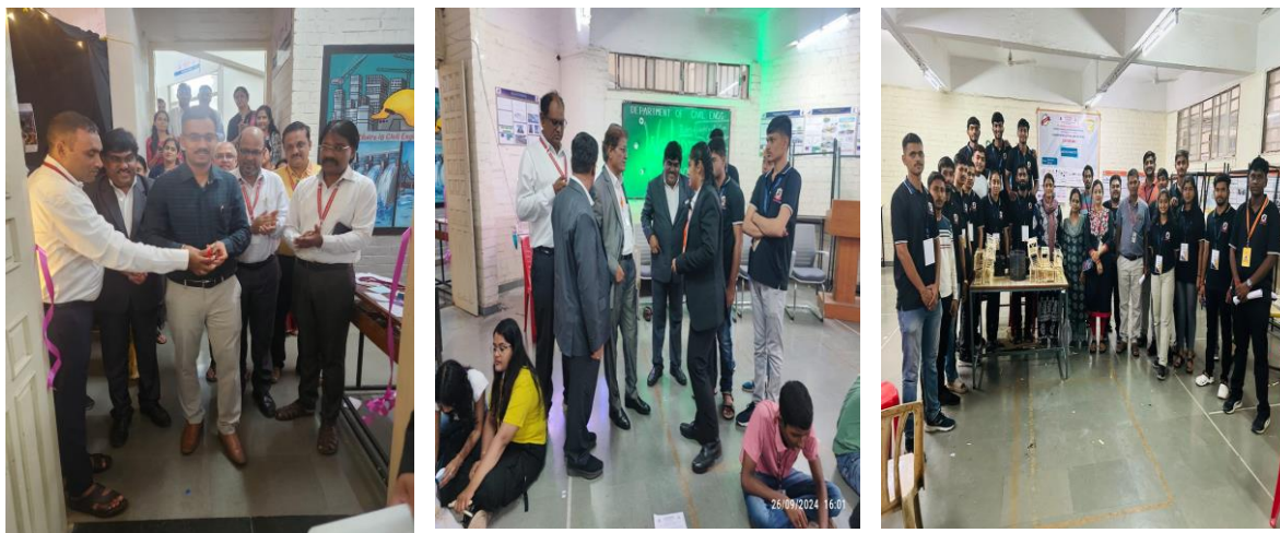
Glimpses of Civispark and ET 2024