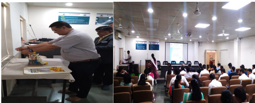
Garlanding of statue by Parent, on occasion of Parent meet