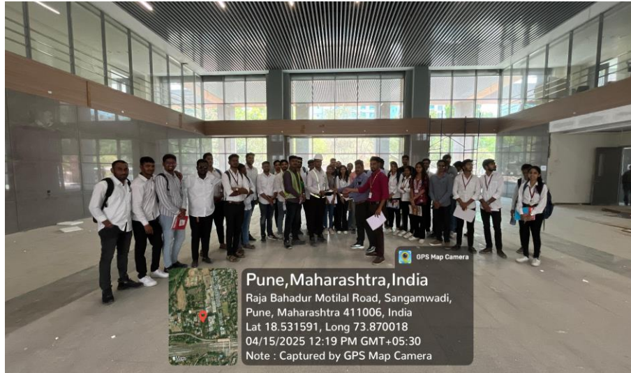
Site Visit at Bharat Ratna Atal Bihari Medical College, Pune