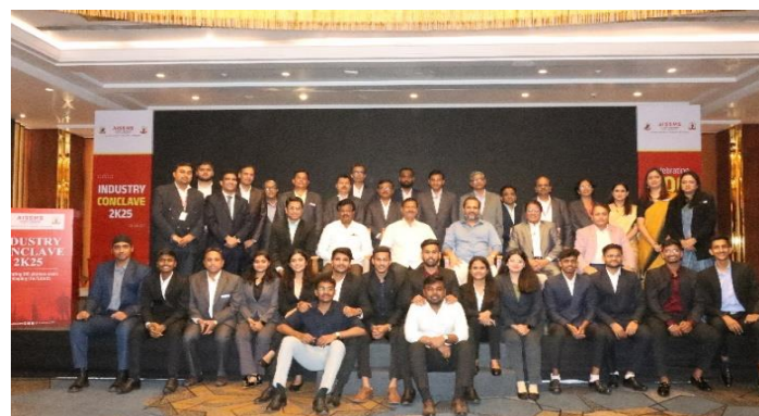
Group Photo of Industry Conclave 2k25