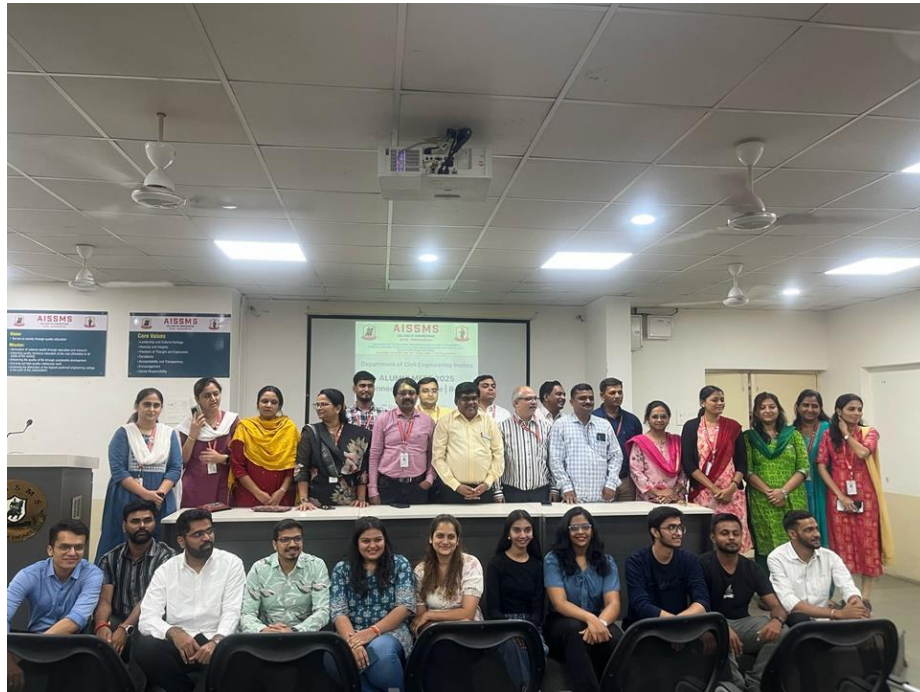
Group Photo of Alumni Meet