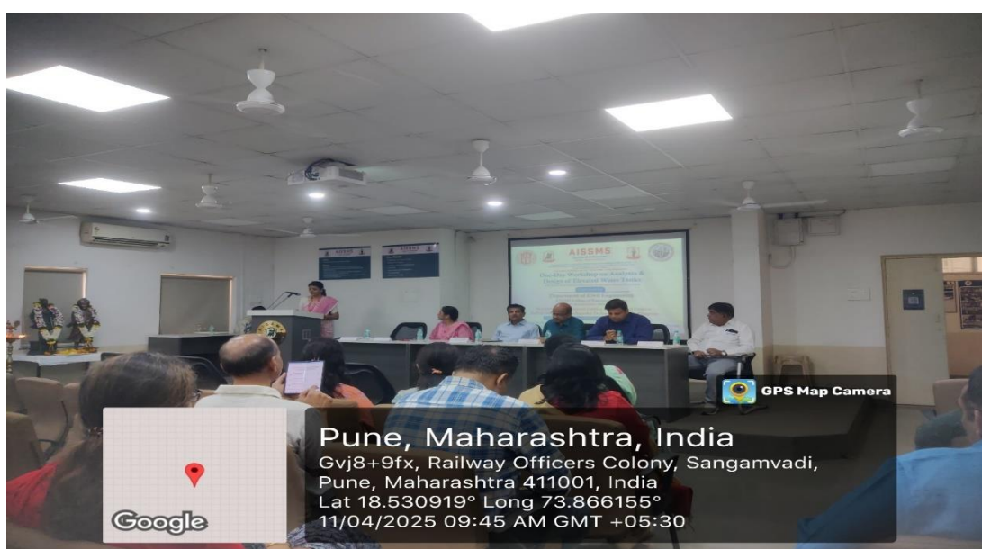
Glimpses of Workshop on Analysis & Design of Elevated Water Tanks