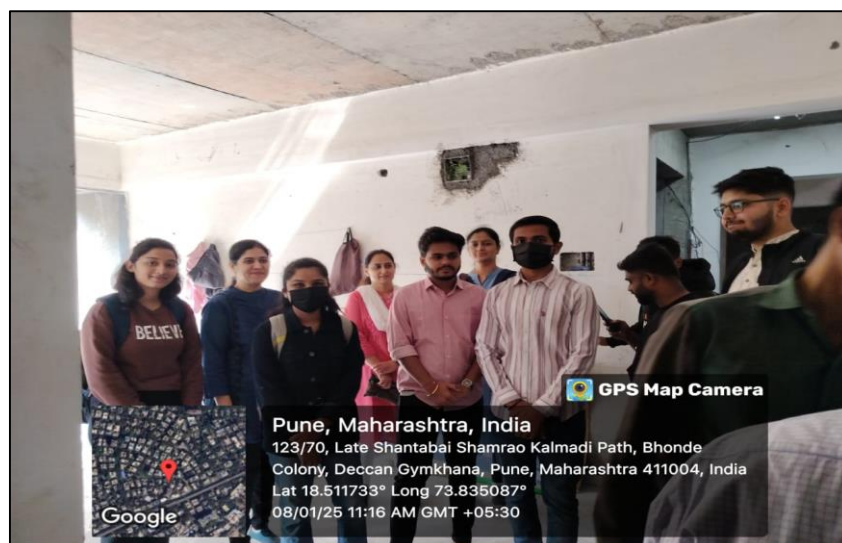
Educational Visit organized for ME (CM) students at Ashwini Apartments Erandwane