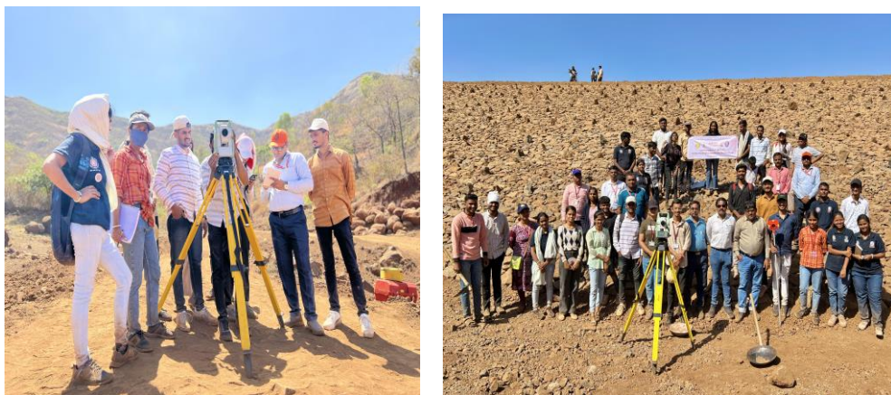
Glimpses of Kalyan Village for Pradhan Mantri Aawas Yojana under Unnat Bharat Abhiyan