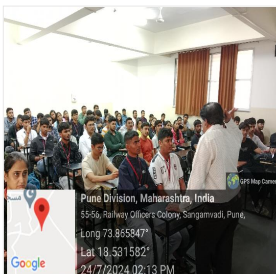
Induction Program for Civil Engineering students