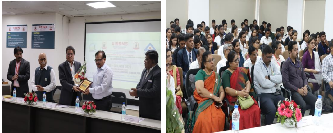
Glimpses of National Level Event “RAIL-GEOFEST 2025”