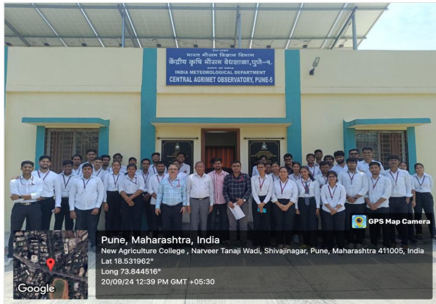
Educational Visit of HWRE