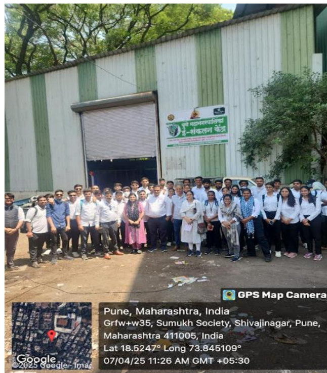
Site visit for TE students for SWM subject at Transfer section, Ghole road, Pune