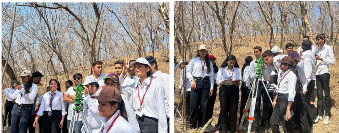
Glimpses of Tulapur Survey