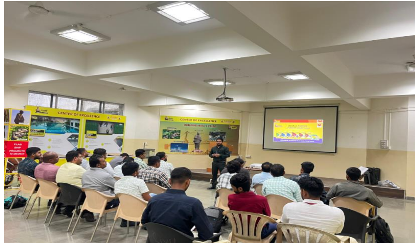
UltraTech Training at CoE lab