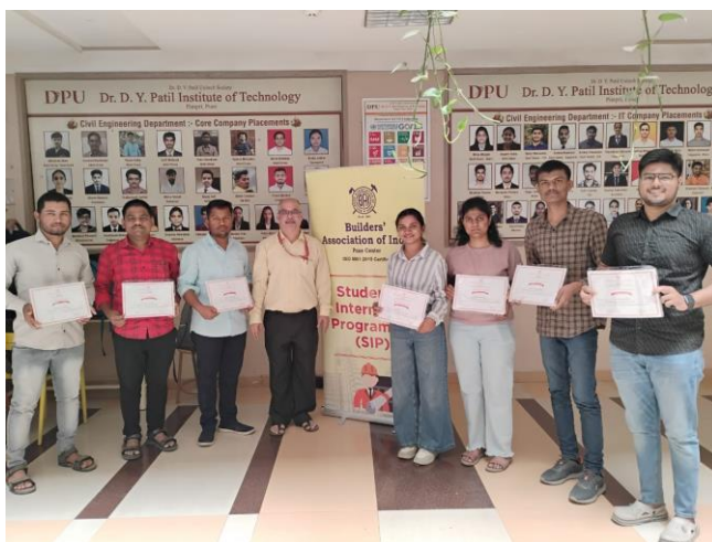
Best Performance award by Builder association of India