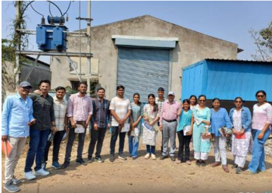
Site visit for ME (Structural Engg) at ABHUVA innovative Pvt. Ltd.