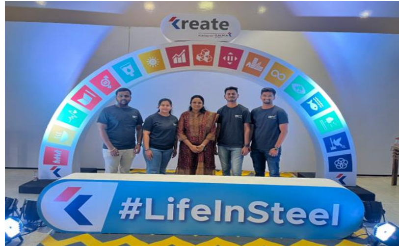
State level Fianle, organised by Kalika steel pvt. Ltd. at Jalna