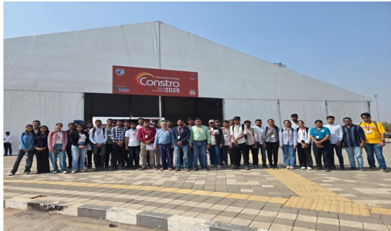
Visit at International Expo Constro 2025 in association with PCERF