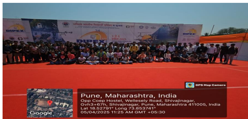
Visited DIPEX 2025