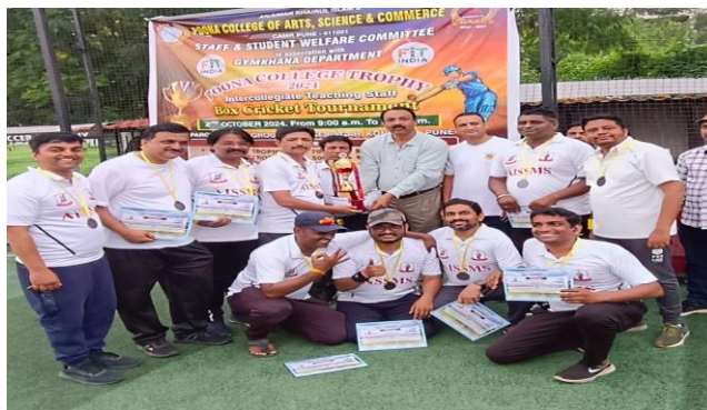
AISSMS Winner of Inter College Cricket match