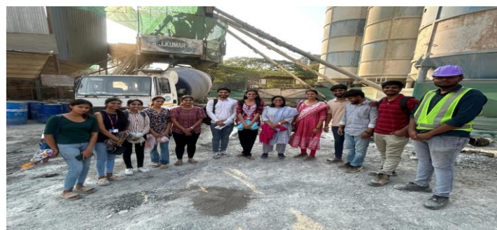
Visit at J Kumar Infraproject RMC Plant