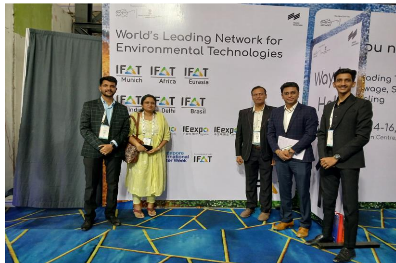
IFAT Expo, Mumbai