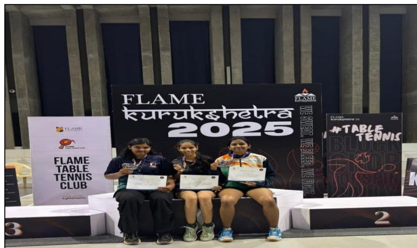
Flame Kurukshetra 2025