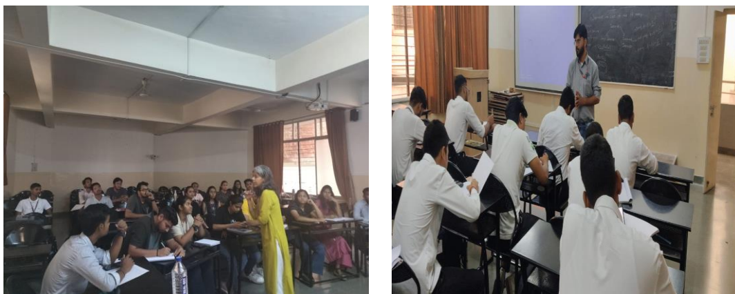
Glimpses of Soft skill training Program