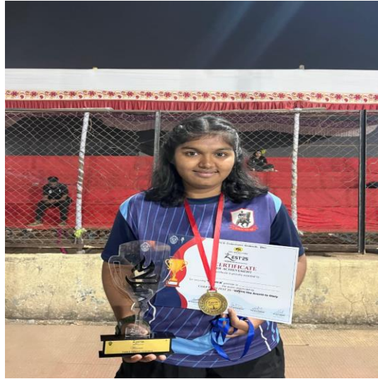
Winner for Table Tennis at Zest 2025