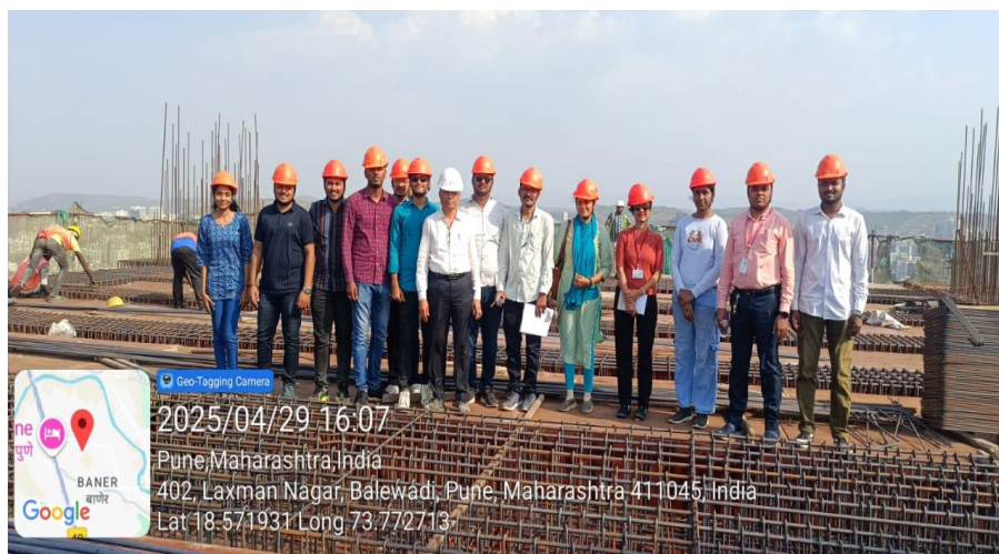
Site visit for ME (Structural Engg) at vertica, Balewadi