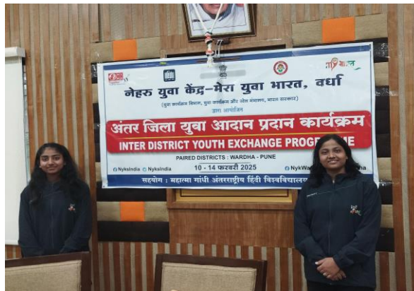
Inter district youth exchange programme