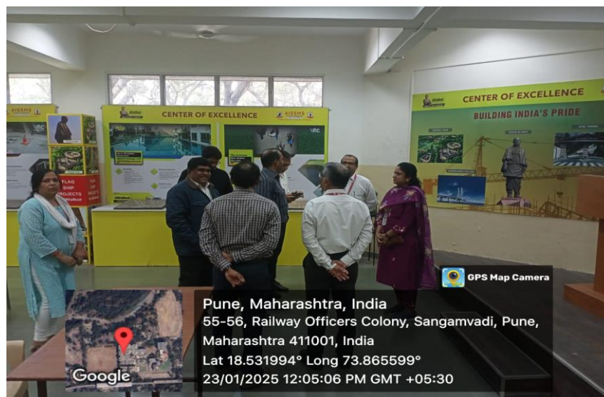
ATE Huber Industry visit at CoE lab