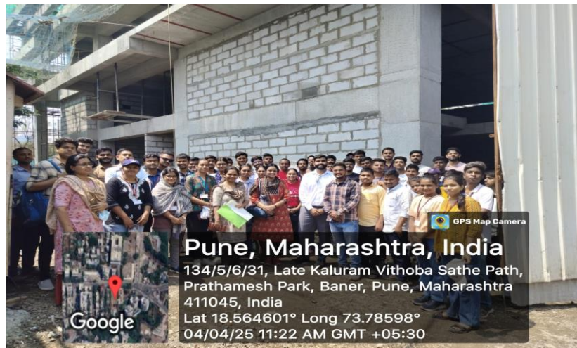
T.E. Educational Visit under DRCS