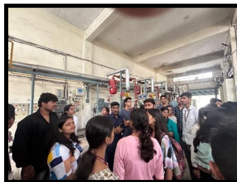
Superheated Steam generation Section