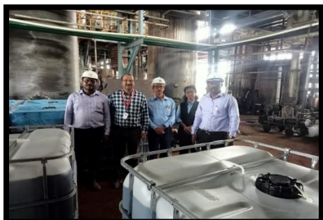
Magnesia Chemical Plant