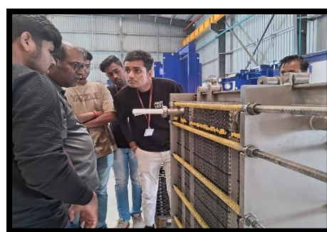
Director explains student about Plate type HE