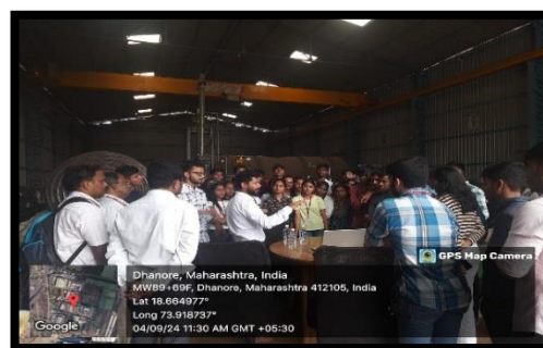
Manager Explains Lactic Acid Plant