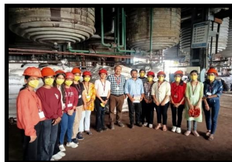
Magnesia Chemical Plant