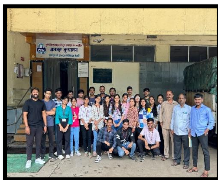
Group Photo Visit