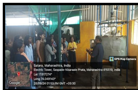
CEO Explains the batch process