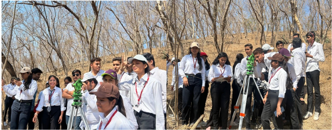
Glimpses of Tulapur Survey

❖ National Level symposium “Civispark and ET 2024” has organized successfully on 26 th and 27 th Sept 2024.