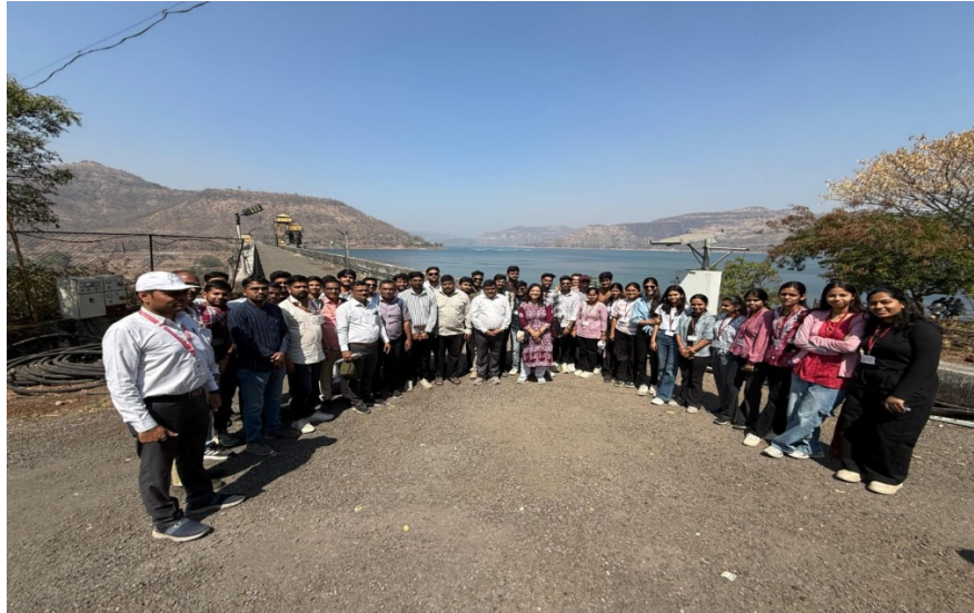
Site visit for B E at Dimbhe dam