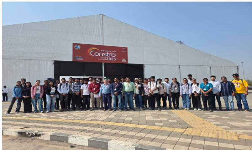
Visit at International Expo Constro 2025 in association with PCERF