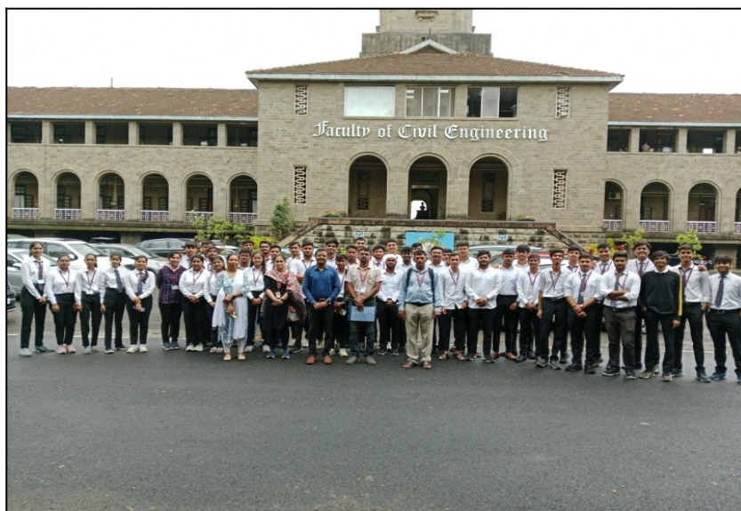
Visit at College of Military Engineering, Pune