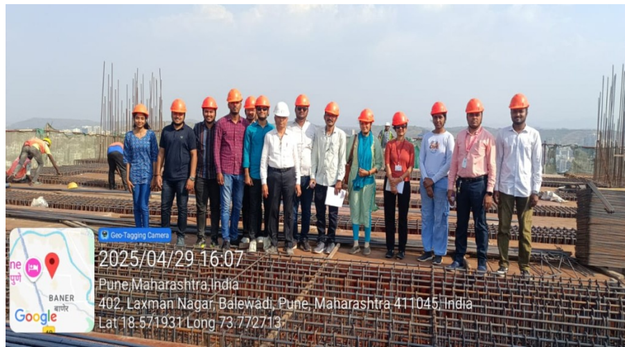
Site visit for ME (Structural Engg) at vertica, Balewadi