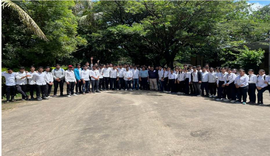
Visit at Sant Tukaram Sahakari Sakhar Karkhana Ltd. Mulshi