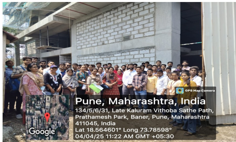
T.E. Educational Visit under DRCS