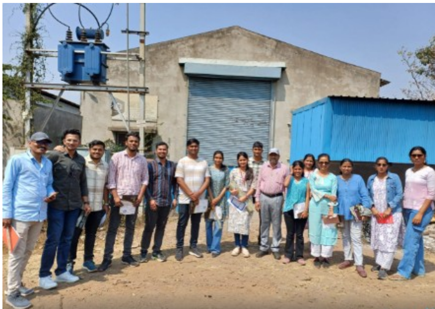
Site visit for ME (Structural Engg) at ABHUVA innovative Pvt. Ltd.