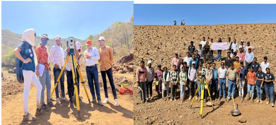
Glimpses of Kalyan Village for Pradhan Mantri Aawas Yojana under Unnat Bharat Abhiyan