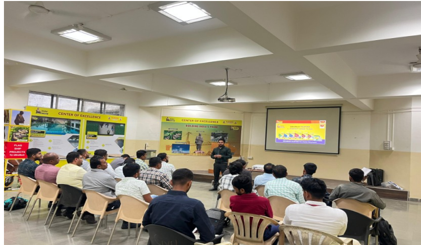
UltraTech Training at CoE lab