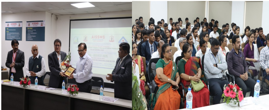
Glimpses of National Level Event “RAIL-GEOFEST 2025”