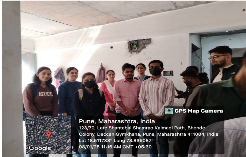
Educational Visit organized for ME (CM) students at Ashwini Apartments Erandwane