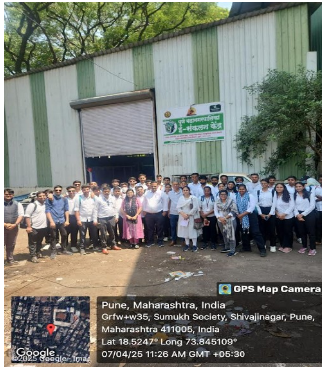
Site visit for TE students for SWM subject at Transfer section, Ghole road, Pune