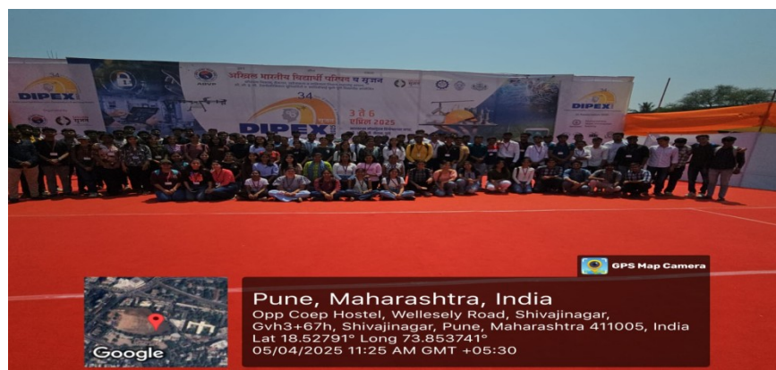
Visited DIPEX 2025