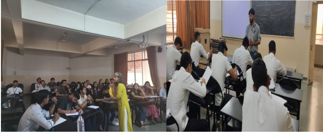
Glimpses of Soft skill training Program