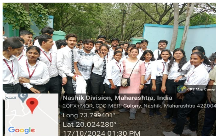
Visit at MERI Nashik