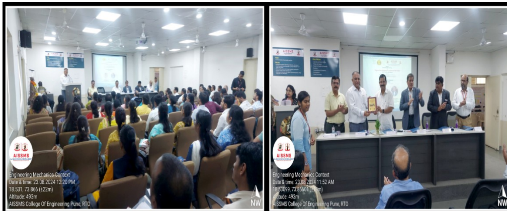
Glimpses of ‘Implementation of Engineering Mechanics in Context of NEP -2020’