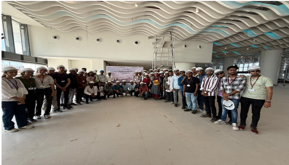
BE Civil Visit at MBPT, Mumbai