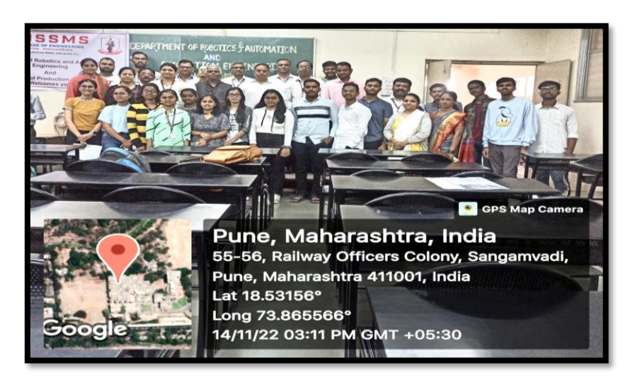
FE Induction Program