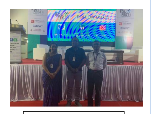
During Visit to EduFest

It's a great pleasure to present our newsletter for the 2nd Quarter (October to December) AY 2022-23. Department of Production Engineering been has consistently endeavoring to skills upgrade the and performance of students and Faculty/staff members through various ventures.