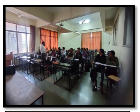
Expert talk on ANN and AI