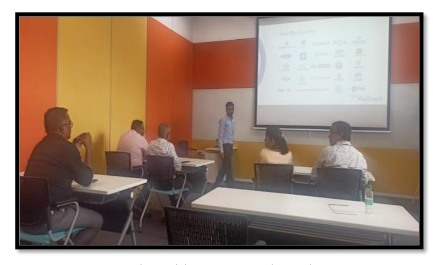
Interaction with A'Raymond Employees