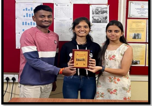
Award won by Students for Participation in Amritmahotsav competition organized by Department of Civil and Computer Engineering, AISSMS COE, Pune