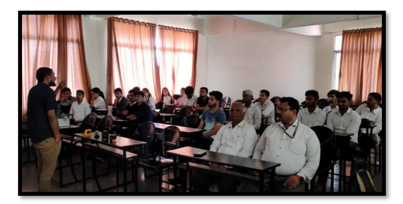
Expert talk on Industrial Automation Sofcon India Pvt. Ltd. On the occasion of Engineers Day on 15/09/2022