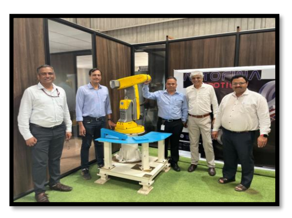
Industry Institute Interaction and Workshop at Autofina Robotics, Pune