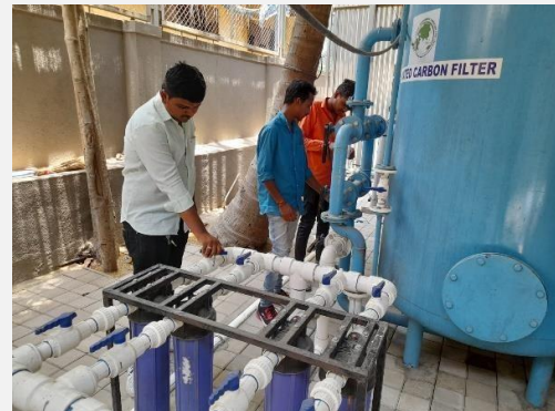
Water and water waste management plant