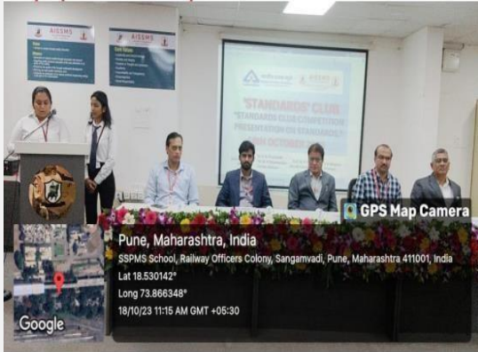
Presentation on Standards