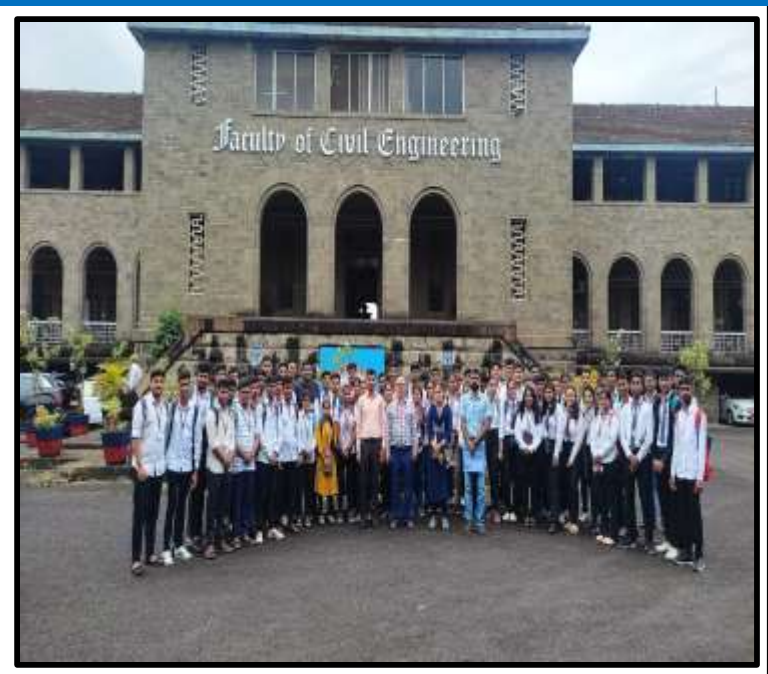
Site visit organized for SE Civil students at College of Military Engineering on 08.09.23.