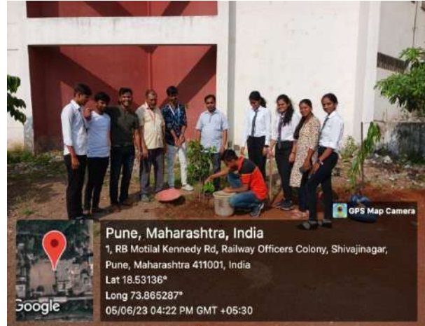
NSS volunteers present in the program