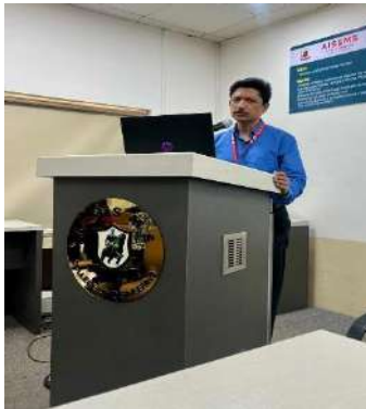
The guest lecture was delivered by expert