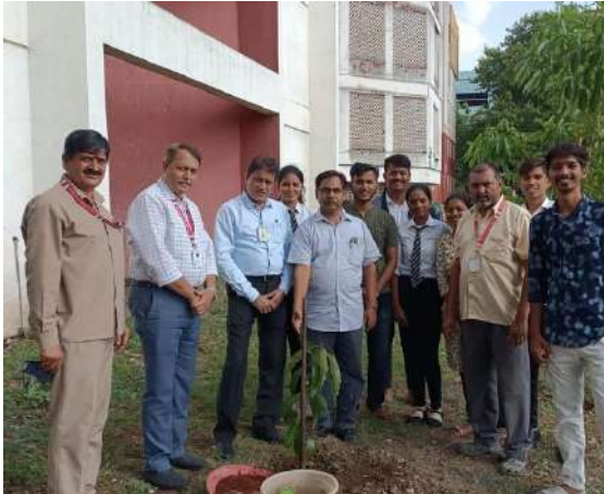
Our NSS volunteers with dignitaries.