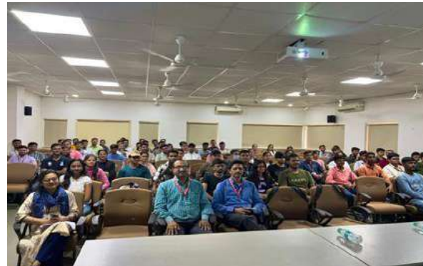
All the NSS volunteers present in the program