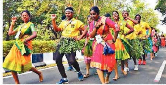
आपती व्यवस्थापन प्रशिक्षण शिबिरातून काढण्यात आलेल्या शोभायात्रेत विद्यार्थ्यांनी असे नृत्य सादर केले.

आपती व्यवस्थापनचे धडे गेल्या आठवडाभरापासून गिरवणाऱ्या या स्वयंसेवकांना शोभायात्रेसाठी 'भारतीय स्वातंत्र्याचा अमृत महोत्सव ही विम देण्यात आली होती. तिथि विषयांवरील फलक, सजीव देखावे सादर करताना देशाच्या स्वातंत्र्याचे अचूक आकलन युवा पिढीला झाले असल्याचा प्रत्यय शोभायात्रेतून येत होता. महाराष्ट्राच्या लोकपरंपरेला देखील यावेळी अभिवादन करण्यात आले. यामध्ये १६ विद्यापीठांनी आपली कला सादर करून उपस्थितांना खिळवून ठेवले.