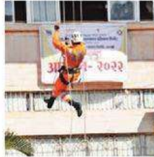
प्रत्यक्षिक सादर करताना एनडीआरएफचे स्वयंसेवक

उंच इमारतीमध्ये आपत्ती उदभवल्यावर परिस्थितीचा अंदाज घेत दोरखंडाद्वारे कोणत्या प्रकारचे बचावतंत्र वापरायचे याचा अंदाज