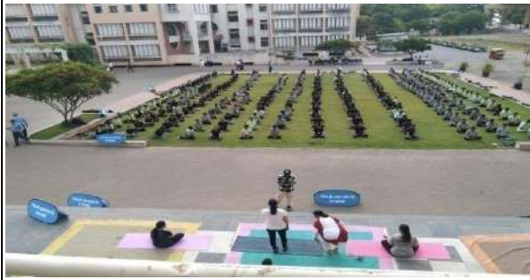
A glimpse of the Event