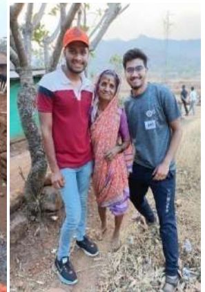
Fort Conservation Program (Rajgad)