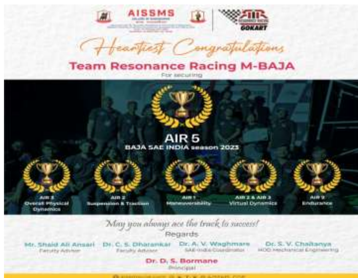
BAJA SAEINDIA 2023 – All India Rank 5