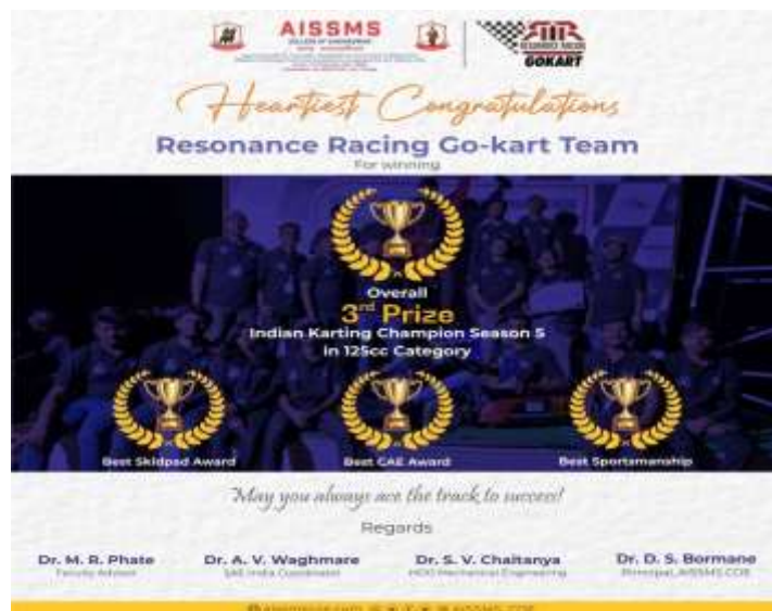
Resonance racing Go-kart 2023 – All India Rank 3