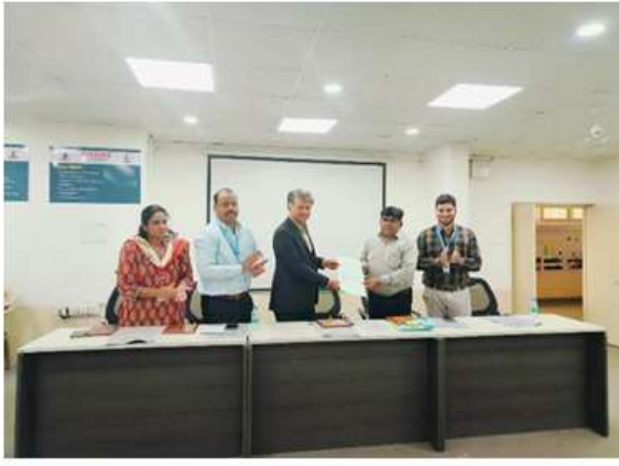
Department of Civil Engineering, AISSMS COE, Pune in association with Pune Construction Engineering Research Foundation have organised the exchange of memorandum of understanding (MoU) on Friday, 12th April 2024