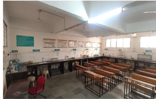
Environmental Engg. Lab