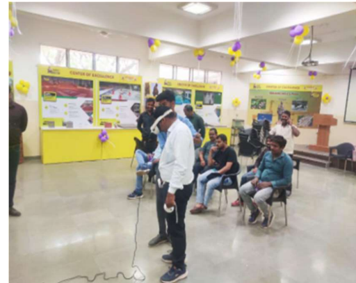
Workshop on "Virtual Tile Applicator Module" organised by UltraTech Cement Limited and Department of Civil Engineering, AISSMS COE, Pune, on 22 March 2024