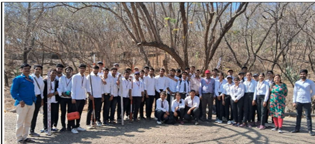
Educational visit for Survey Road Project at APCOER, Parvati hills on 04.03.2024