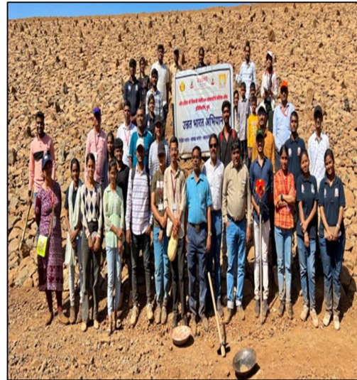
Topographical survey at Kalyan Percolation Tank under Unnat Bharat Abhiyan on 09.03.24