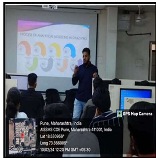
Department of Civil Engineering, AISSMS COE, Pune in association with ZAS consultant has arranged value added course of 50 hours on "Industrial Steel Structures: Comprehensive Design Training using STAAD Pro".