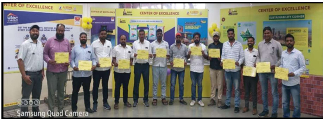
Workshop on “Level -3 Skill Building Workshop for Practising Contractors” organised by UltraTech Cement Limited and Department of Civil Engineering, AISSMS COE, Pune, on 22 Feb 2024