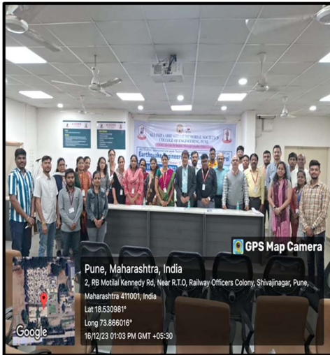
Department of Civil Engineering organized One-week FDP under ATAL Scheme on 'Earthquake Engineering & Vibration Control' during 11.12.23 to 16.12.23