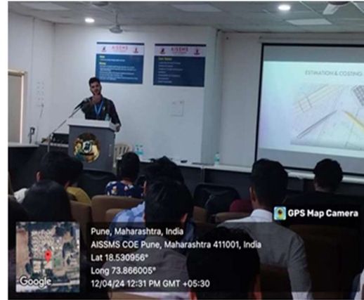
Department of Civil Engineering, AISSMS COE, Pune in association with Pune Construction Engineering Research Foundation have organised the Expert session on Friday, 12th April 2024