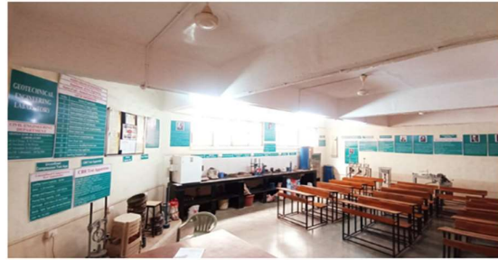
Geotechnical Engg. Lab