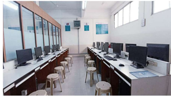
PG Computer Lab