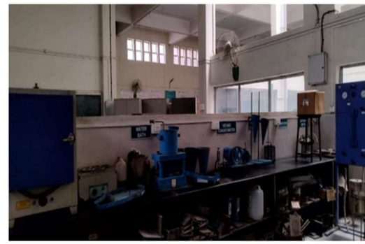
Transportation Engg. Lab