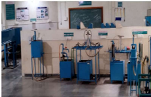
Fluid Mechanics Lab