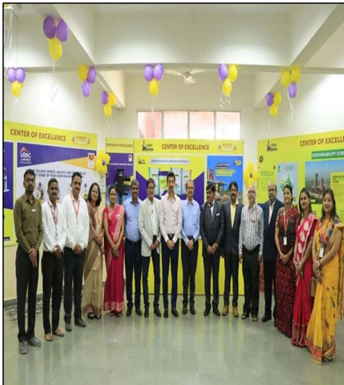
Inaugural Ceremony of Center of Excellence Lab on 16.02.2024