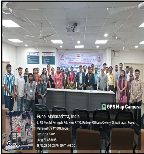
Department of Civil Engineering organized One-week FDP under ATAL Scheme on 'Earthquake Engineering & Vibration Control' during 11.12.23 to 16.12.23