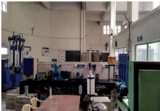
Testing of Materials Lab