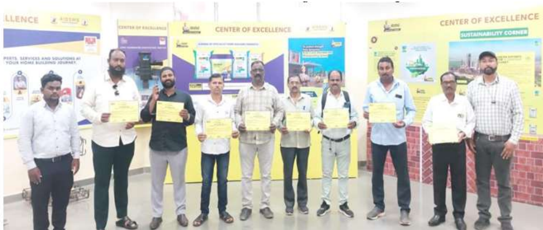
Workshop on “UltraTech Building Products” for Practising Contractors Students and Faculties organised by UltraTech Cement Limited and Department of Civil Engineering, AISSMS COE, Pune, on 30 April 2024