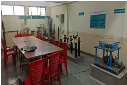
Structural Dynamics Lab