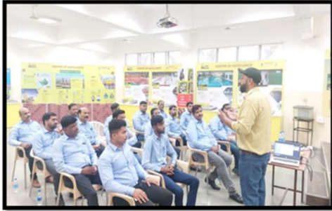
Training on “UltraTech Building Products and Services” for SP Traders Sales/Marketing personnels organised by UltraTech Cement Limited and Department of Civil Engineering, AISSMS COE, Pune, on 26 May 2024