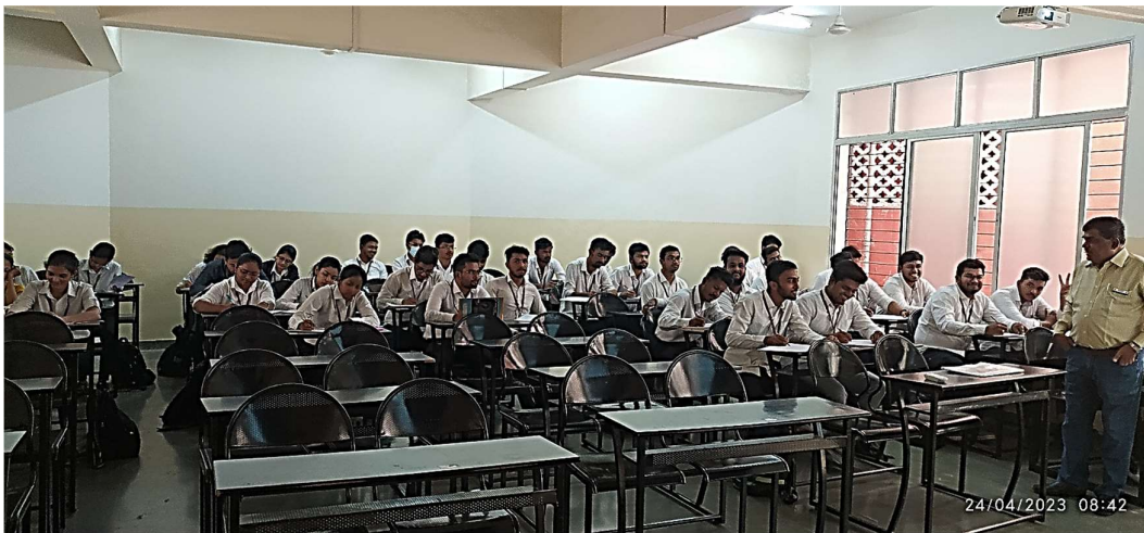
Class room number 444