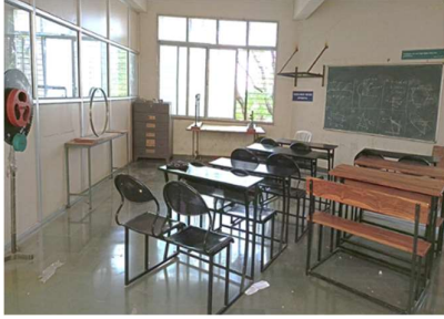
Engineering Mechanics Lab