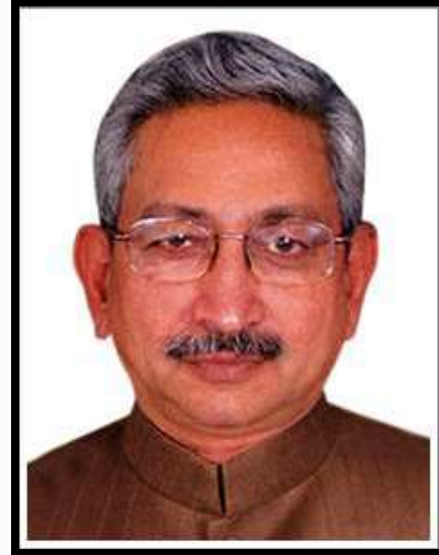
Shri Shahu Chhatrapati Maharaj President, AISSM Society

The teaching program also gives emphasis on practical approach through industry-institute interaction. College organizes various Symposia, Workshops, Conferences and national level students' symposium and exposition 'AISSMS Engineering Today', Cultural Event like Shivanjali and Inter collegiate event named Ashwamedh every year which are a grand success. College has high participants in Sports as well as Cultural Activities. Also students actively work for different Technical teams under Society of Automotive Engineers (SAE). Students are also involved in Social cause under National Service Scheme, which arranges Blood donation Camp every year. Students are also involved in College's Magazine Committee named SHIVDARPAN, which has been publishing finest and creative ideas by our students in a magazine I am confident that the College is in a position to deliver the best theoretical and practical training to the students and offer the best talent to the employers. I wish all the best to the aspiring students, parents, employers and all other stake-holders in achieving their goals.