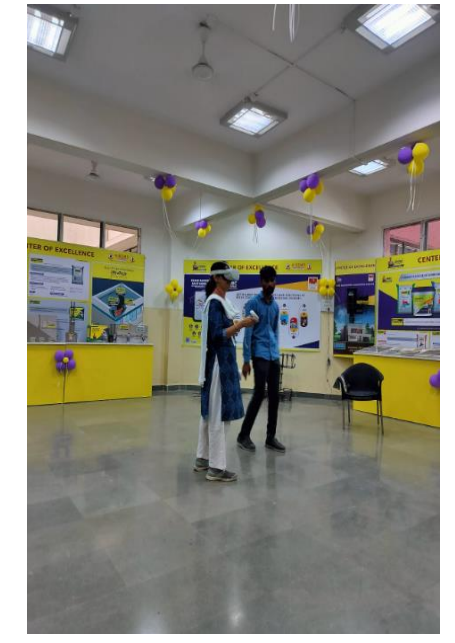
Glimpses of workshop