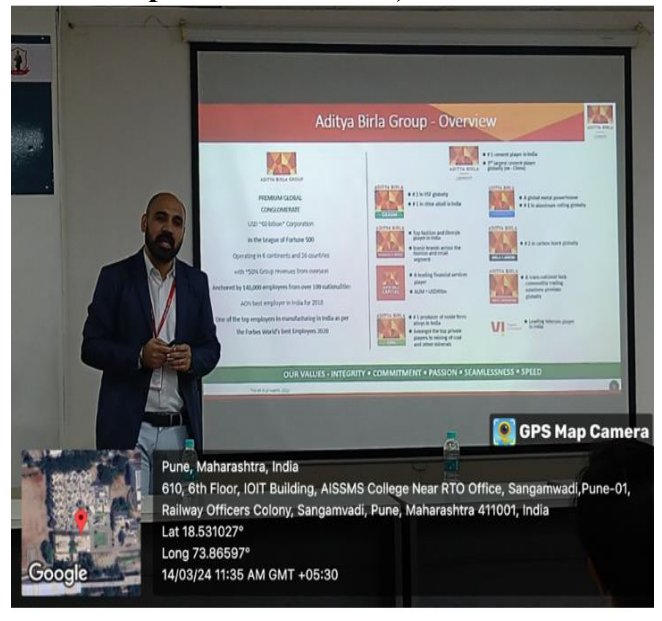
Presentation Given by Leaders