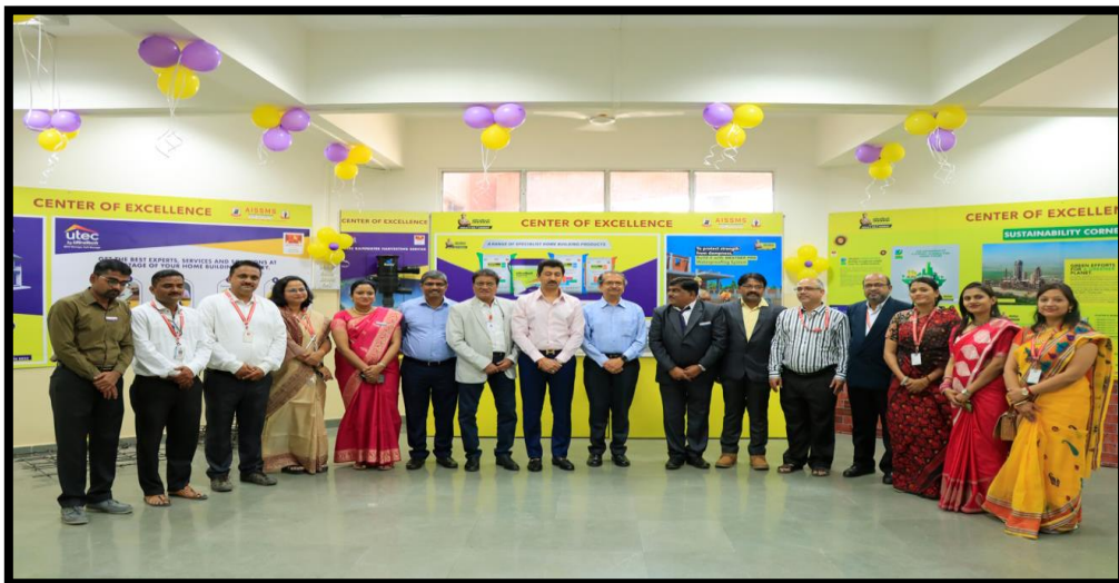
Department of Civil Engineering