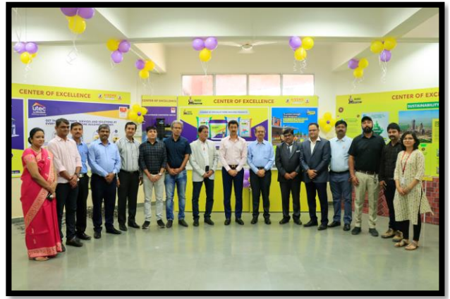
AISSMS and ULTRATECH Family