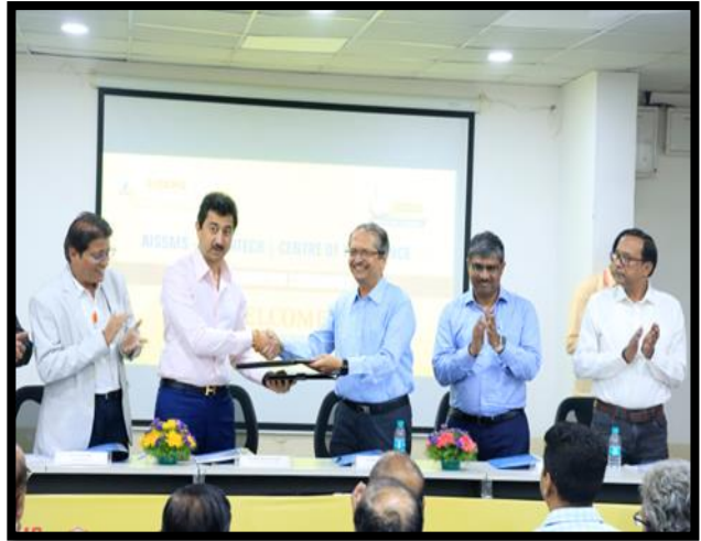
MOU Signing and Exchange