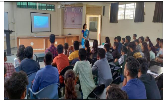
Expert Talk on “Getting to Know Software Industry Practices”(PO5, PO12)