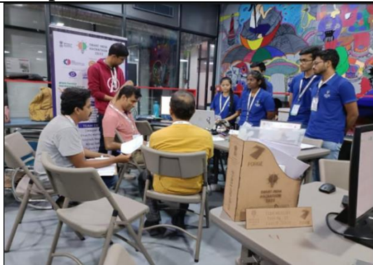
Student Participation in Smart India Hackathon (PO1,PO2,PO3,PO4,PO5,PO6,PO8,PO9,P O10,PO11,PO12)