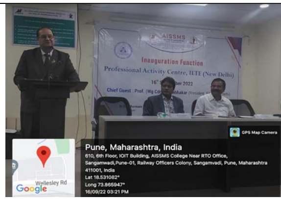
Inauguration of IETE Student Forum(PO8,PO9,PO10)

Few photographs of related to faculty contribution (felicitation of faculty, photos of award function etc.