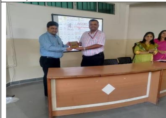
Felicitation of Expert Talk on Digital Marketing (PO8,PO9,PO10)