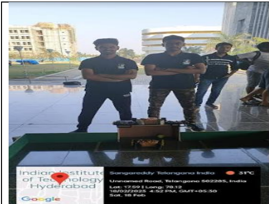
Avit-O-Virtue Club won First Prize at IIT Hyderabad 18/2/2023(PO1,PO2,PO3,PO4,PO5,PO6,P O8,PO9,PO10,PO11,PO12)