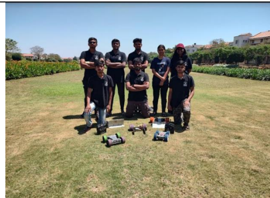
Avit-O-Virtue Club won 3rd prize at Bits Pilani. (PO1,PO2,PO3,PO4,PO5,PO6,PO8,PO9,PO 10,PO11,PO12)