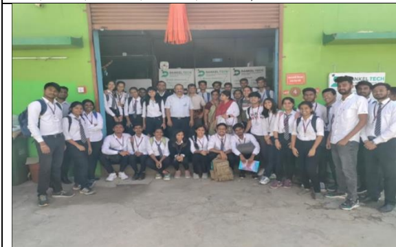
Industry visit of TE (E&TC) and IEEE student branch students to “Dankel Tech Pvt. Ltd.,” Pune (PO1,PO2,PO3,PO4, PO12)