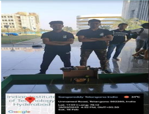
Avit-O-Virtue Club won First Prize at IIT Hyderabad 18/2/2023 (PO1,PO2,PO3,PO4,PO5,PO6,PO8,PO9, PO10,PO11 and PO12)