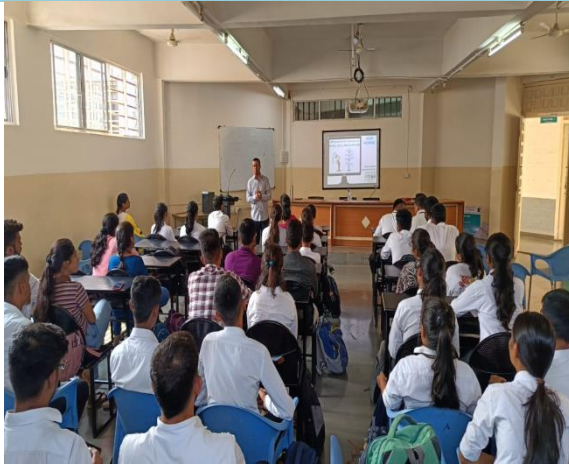
Career Guidance in Management 17/04/2023