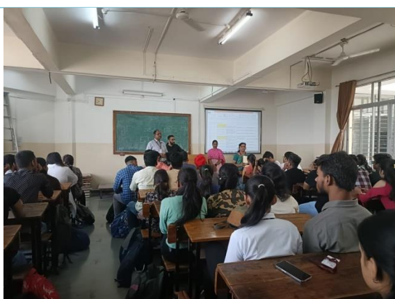
Seminar on “How to prepare for GATE” 24/04/2023 under IEEE