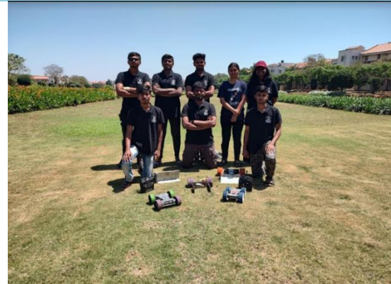
Avit-O-Virtue Club won 3rd prize at Bits Pilani. (PO1,PO2,PO3,PO4,PO5,PO6,PO8,PO9, PO10,PO11 and PO12)