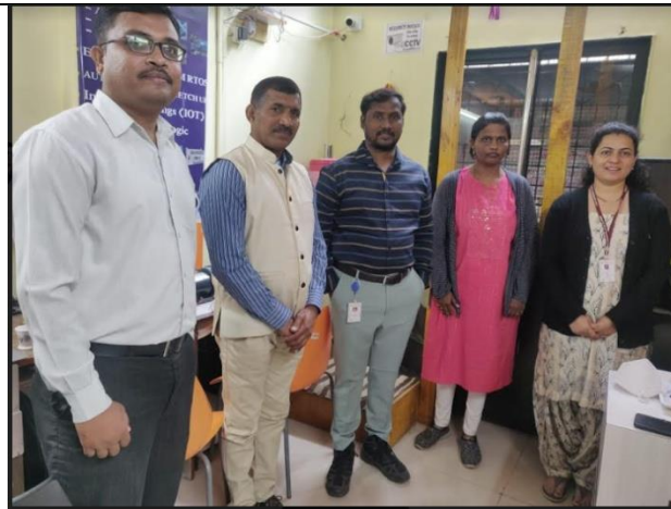
Faculty Visit to CSM Technology,21/12/2021 (PO12)