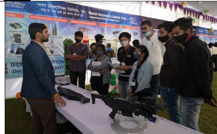
Student Visit to Bharat Electronics Limited, Pune ,17/12/2021 (PO3,PO6,PO8,PO9,PO10,PO12)