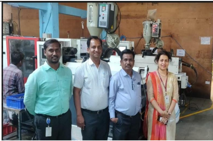
Faculty Visit to Dankel Solutions Pvt. Ltd.(PO12)