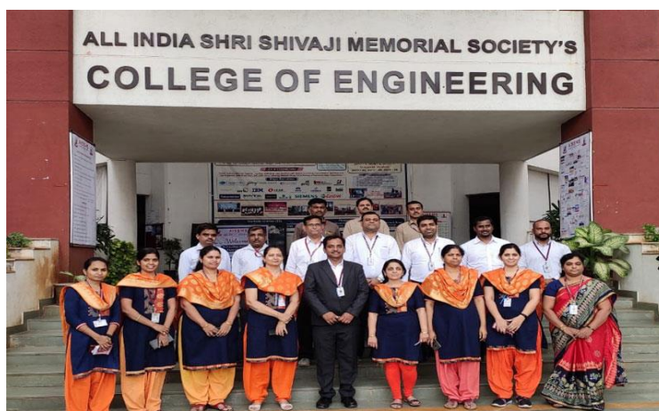
Department Faculty member and Non-teaching Staff