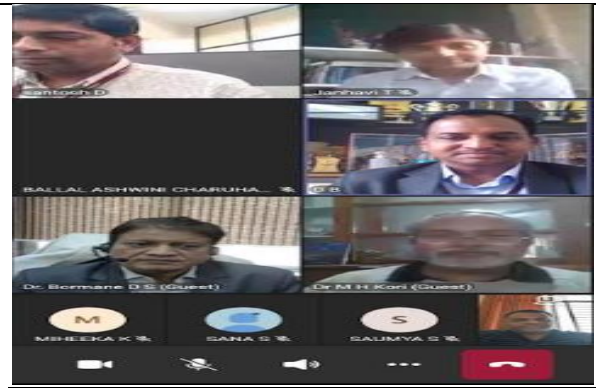
Inauguration of ISF forum ,22/12/2021(PO8,PO9)