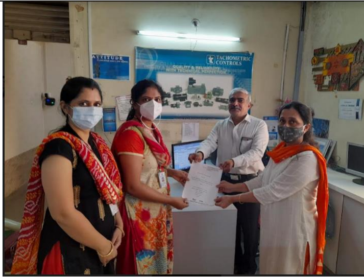
MoU signed with PMP Automation Pvt, Ltd. 16/9/2021