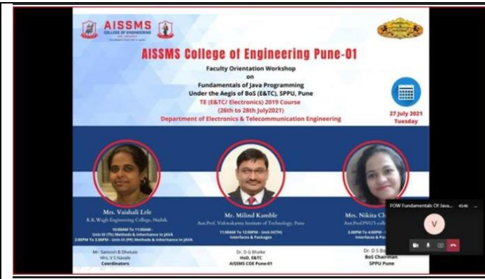
Faculty Orientation Workshop for TE Revised Syllabus.26/7/2021 to 28/7/2021