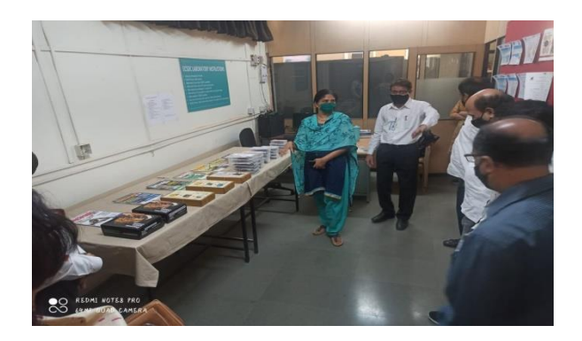
EFY Skill (29/10/2020)

EFY Skill Center Inauguration (Date: 29/10/2020) (PO3,PO4,PO6 and PO7)