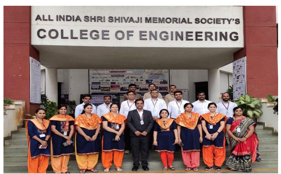
Department Faculty member and Non-teaching Staff