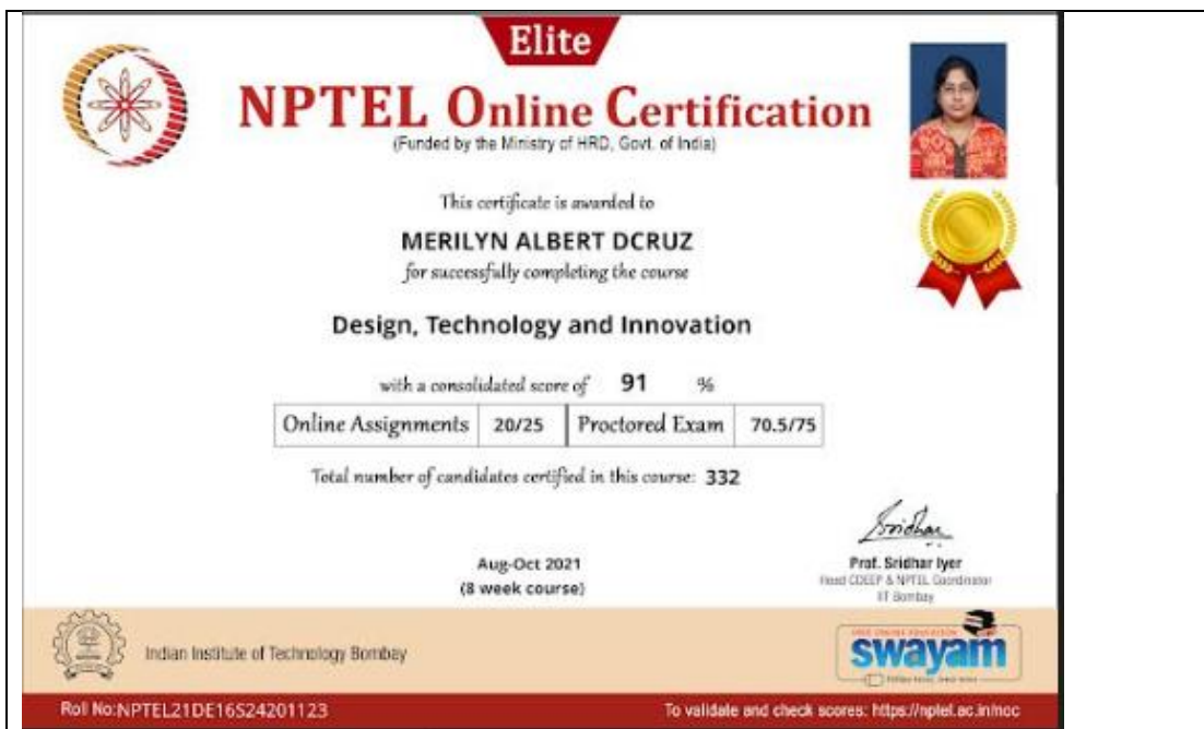
Mrs.M A D’Cruz received Elite +Gold medal in NPTEL Exam