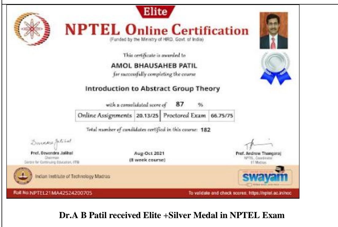
Dr.A B Patil received Elite +Silver Medal in NPTEL Exam