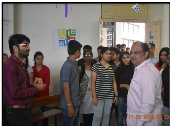
Commencement of Ludomania Event