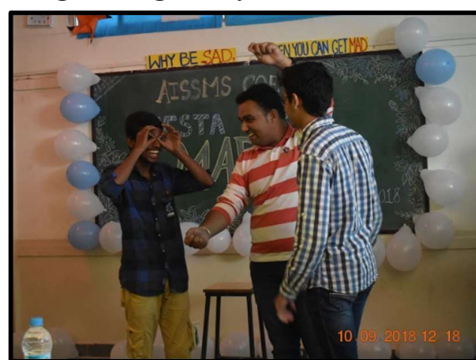
Mad-Ad event in progress