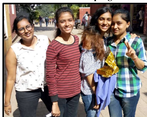
Winners of Technological Hunt Event