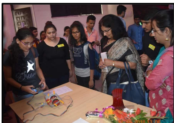
Judgement of Tech-Art Event