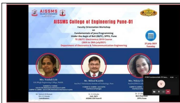
Faculty Orientation Workshop for TE Revised Syllabus.26/7/2021 to 28/7/2021