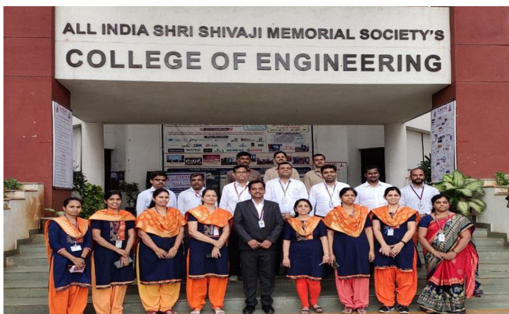
Department Faculty member and Non-teaching Staff