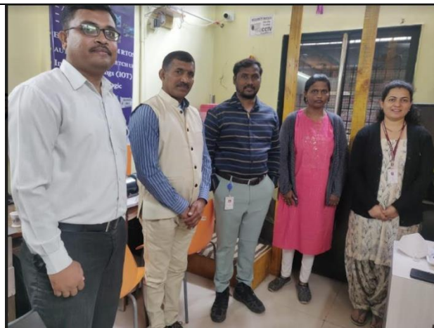
Faculty Visit to CSM Technology,21/12/2021