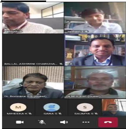
Inauguration of ISF forum ,22/12/2021