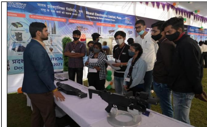
Student Visit to Bharat Electronics Limited, Pune ,17/12/2021