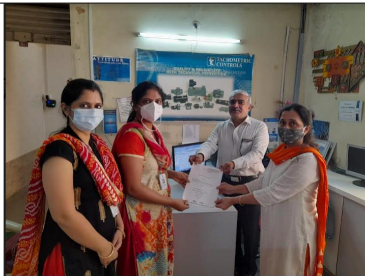
MoU signed with PMP Automation Pvt. Ltd. 16/9/2021