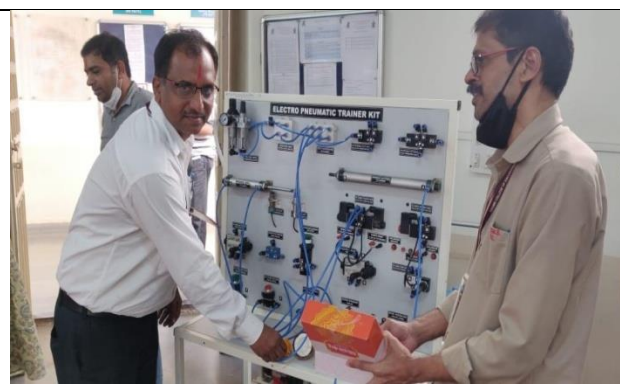
Khandenavmi Pooja in Department on 14/10/2021