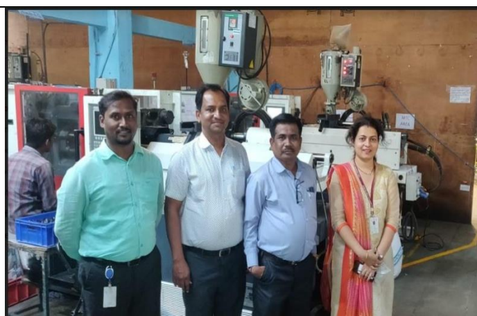
Faculty Visit to Dankel Solutions Pvt. Ltd.