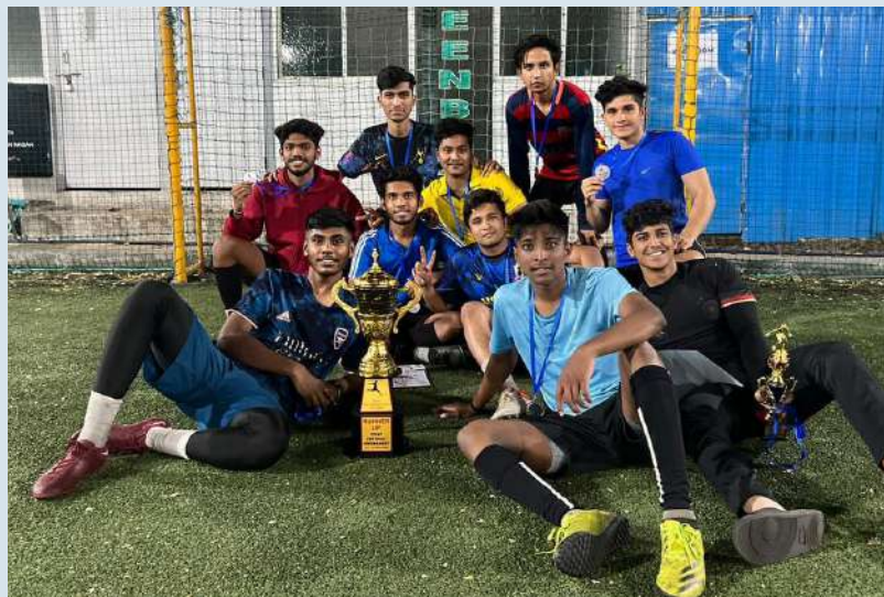
TEKKY competition organized by Firodiya Law College, Pune (Runners-Up)