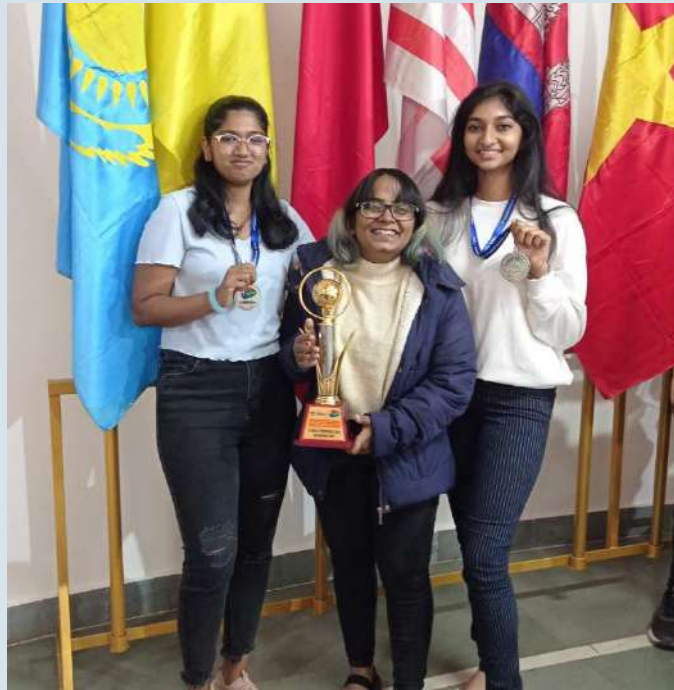
TABLE TENNIS ACHIEVEMENTS

“Summit” National level competition organized by MIT WPU, Pune 2022-2023 – Runner up