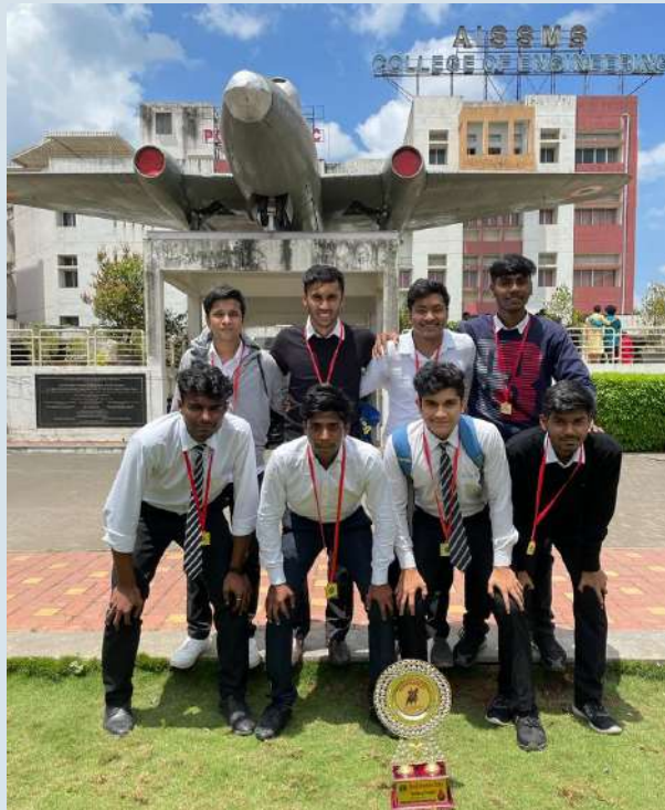
IOIT Football Tournament (WINNER)