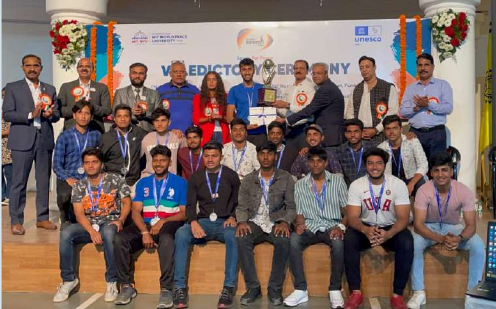
Summit National level competition organized by MIT WPU, Pune (Runners-Up)