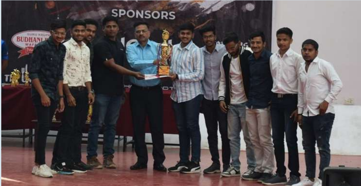
Pace organized by AIT 2022-2023 – Runner up