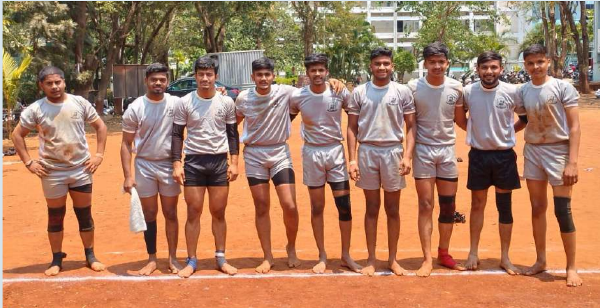
Melange organized by VIT, Pune Runner Up