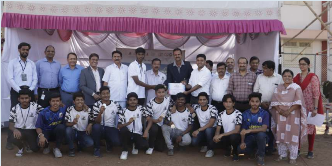
2023- Zest National level Football-Runner Up. (Runners-Up)