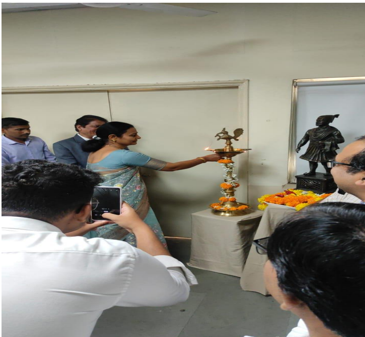
Inauguration by Parents