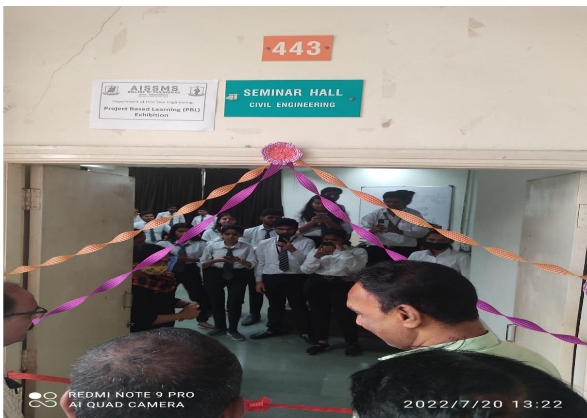
PBL exhibition induration by parents (443)