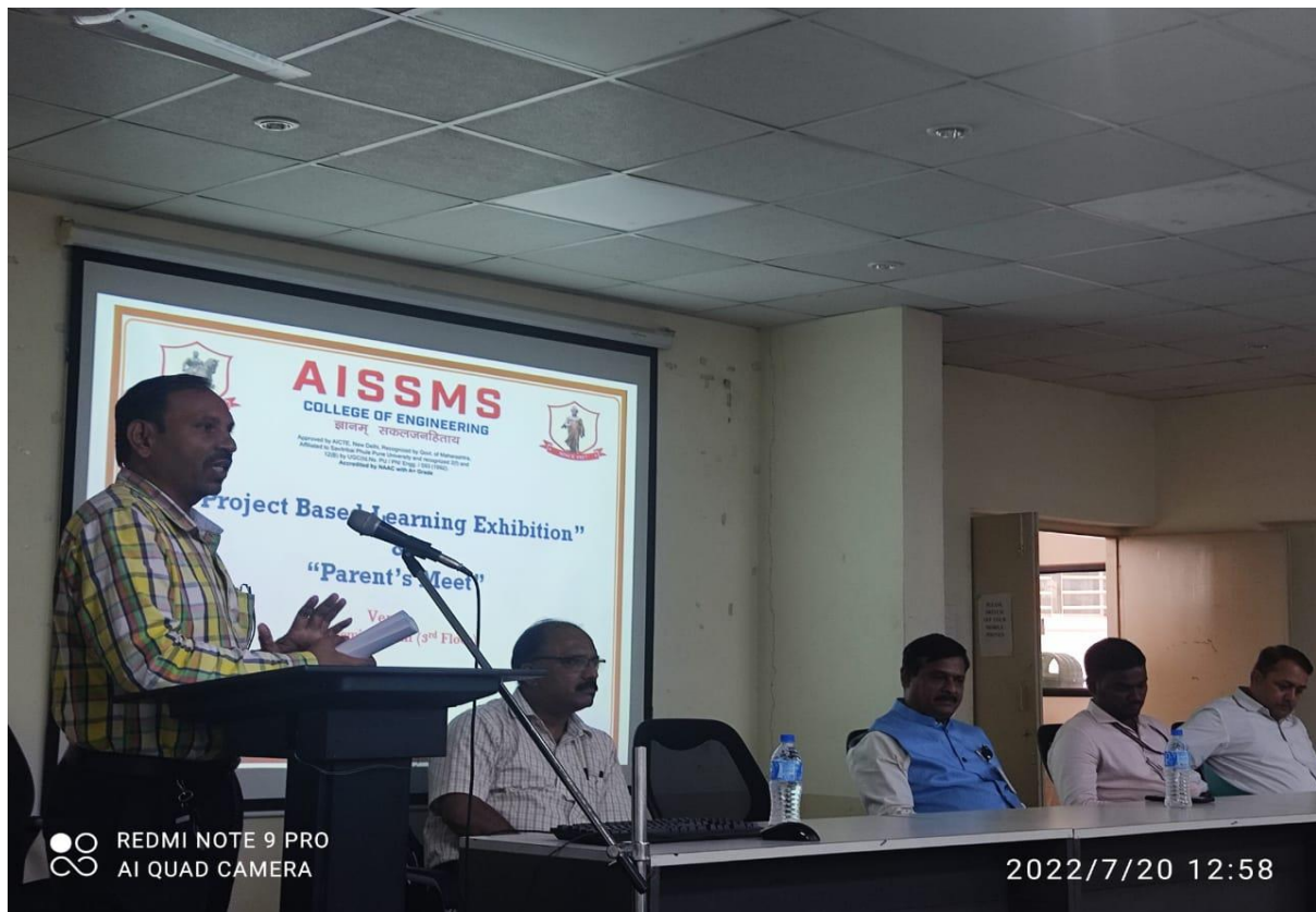
Parents sharing feedback