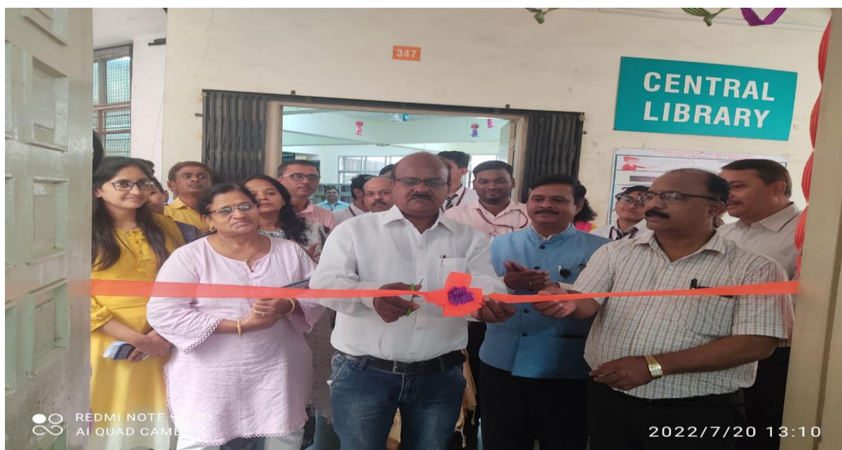
Reading Hall PBL exhibition inauguration by parents (348)

The inaugural program marked its conclusion by 01:30 pm. After that all staff with parents visited to exhibition hall for seeing the talent of their ward. Total 125+ projects were available for exhibition. These entire projects were organised in five seminar halls (348,442,443,344,404). The program was further continued by the inauguration of the PBL Exhibition halls by the traditional ribbon cutting ceremony by parents.