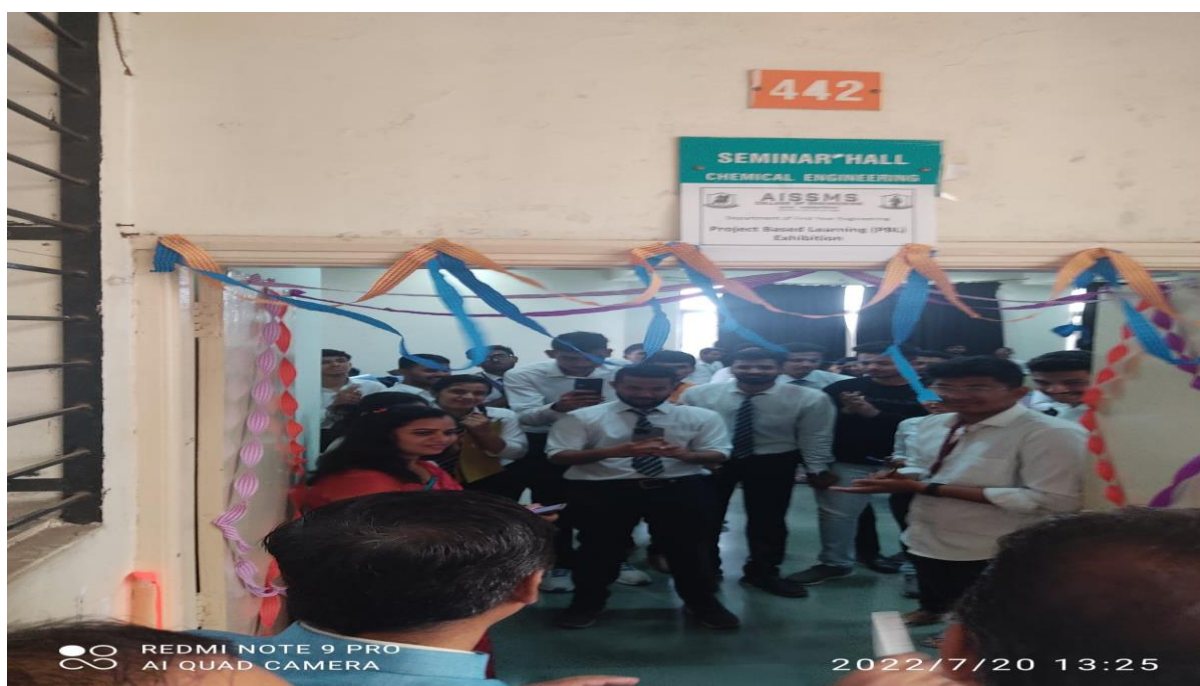
PBL exhibition induration by parents (442)