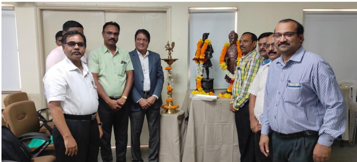
Inaugural ceremony at CITP hall