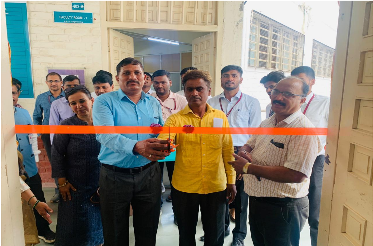
PBL exhibition induration by parents (404)