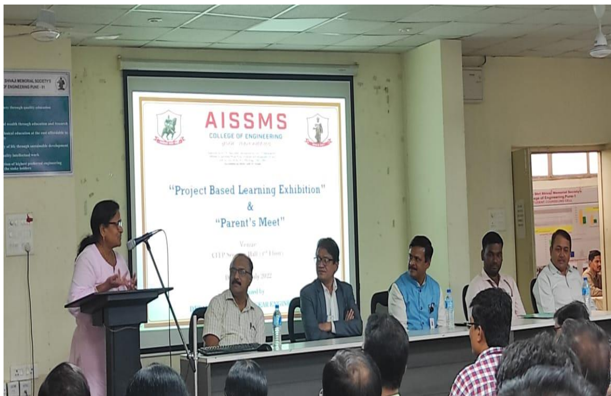
Parents sharing feedback