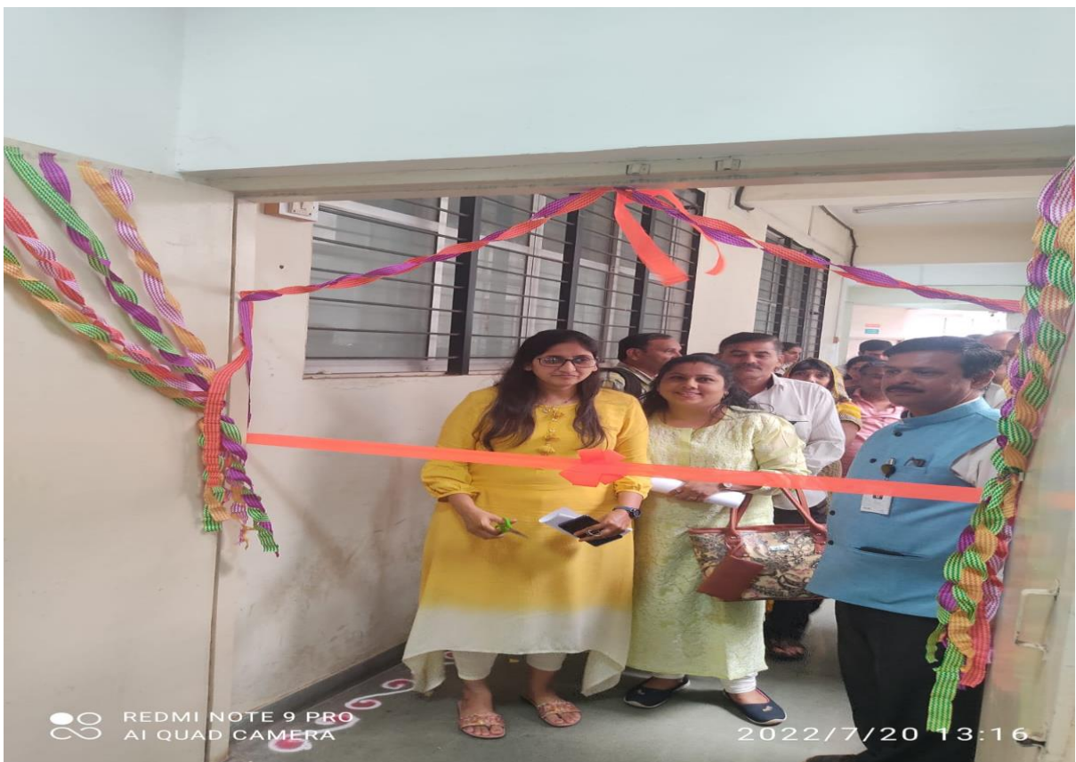
PBL exhibition induration by parents (344)