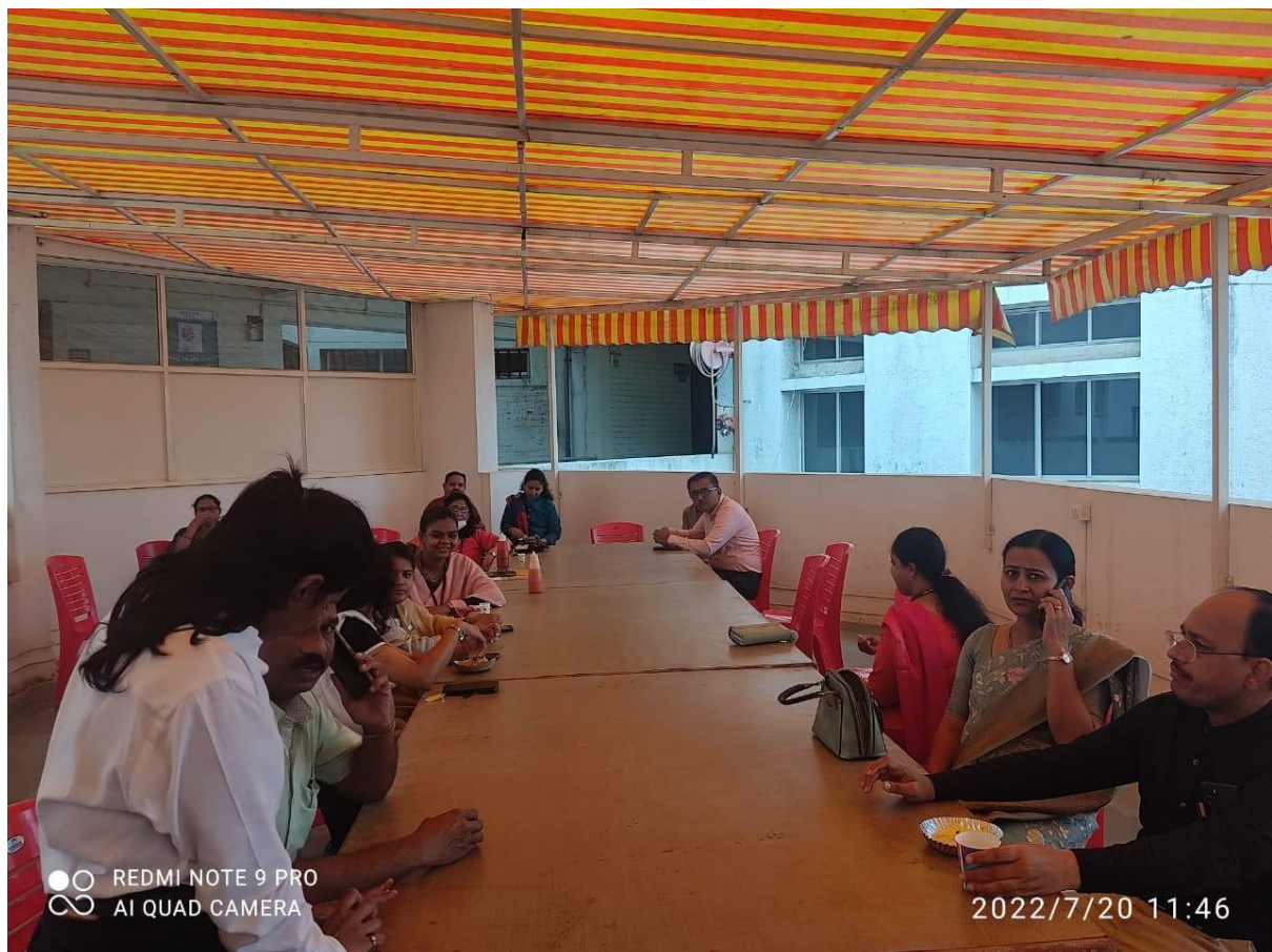
Parents enjoying refreshment