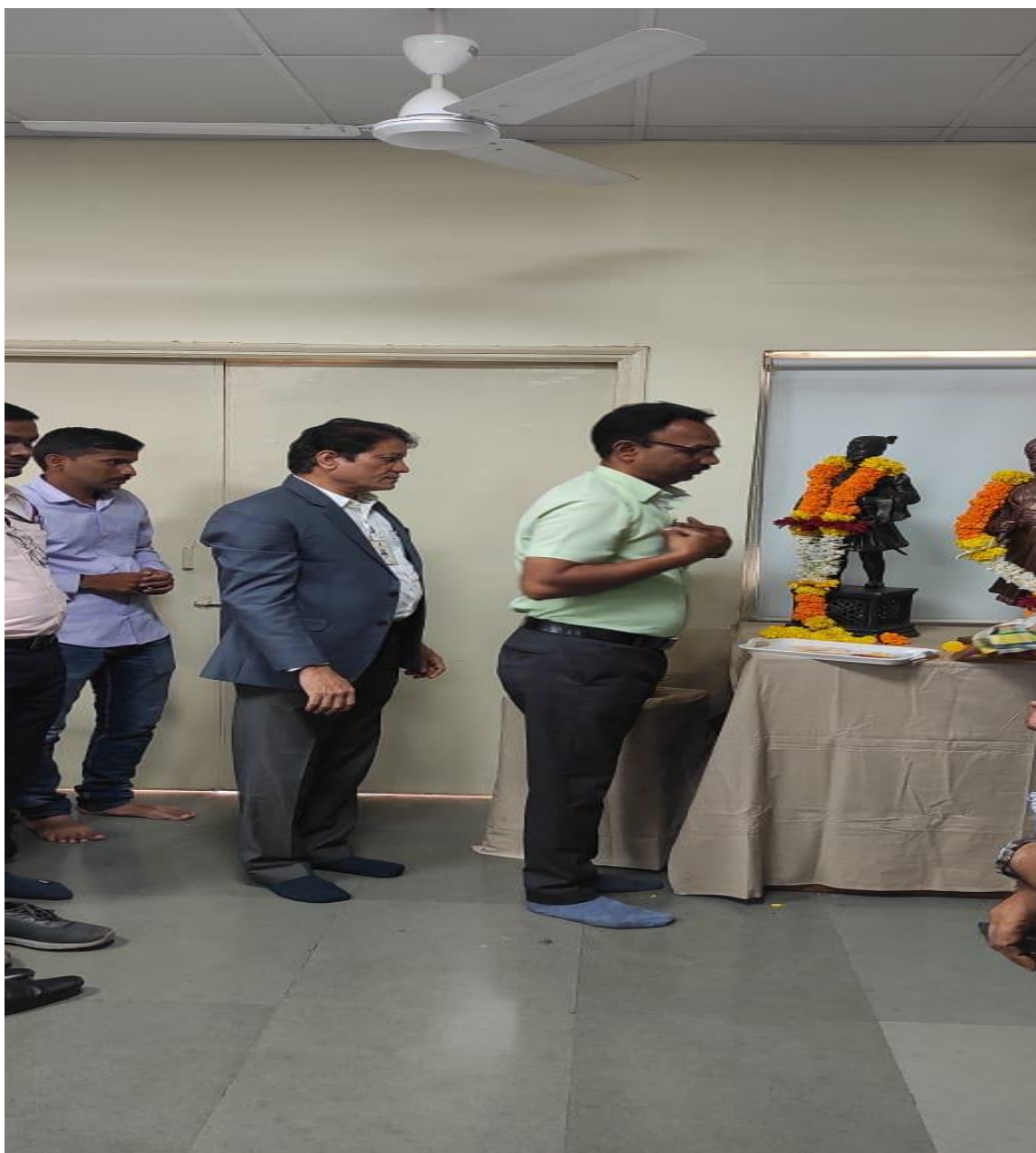
Inauguration by Parents