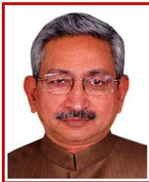
Shri Shahu Chhatrapati Maharaj President, AISSM Society

We are going to concentrate more upon the Engineering Research activities and use those for students and society welfare. I am confident that the College is in a position to deliver the best theoretical and practical training to the students and offer the best talent to the employers. I wish all the best to the aspiring students, employers and all other stake-holders in achieving their goals.