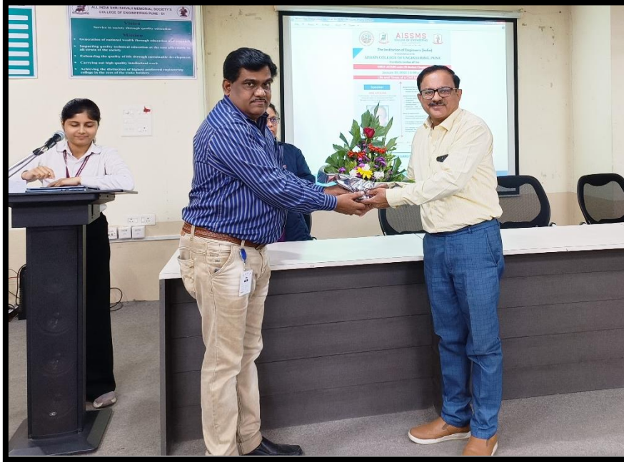
Felicitation of Er Attavar Sir