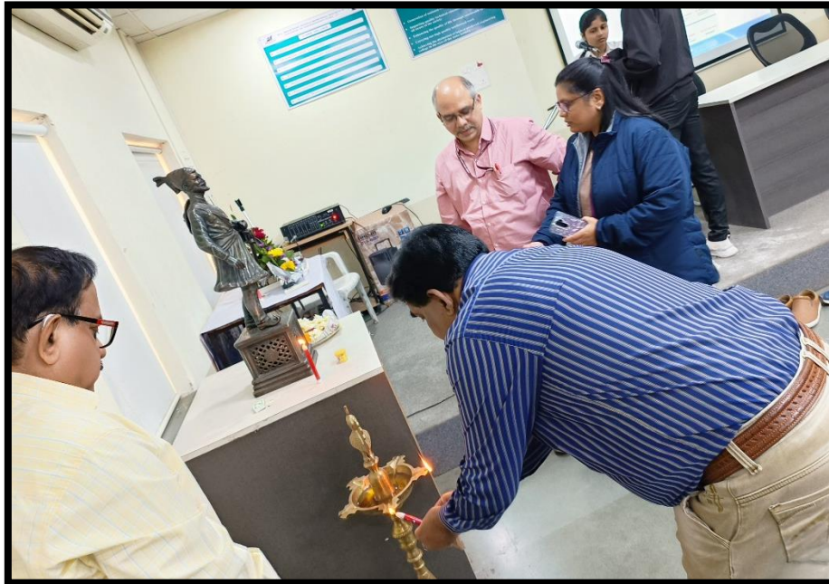
Lightening of the lamp.

Mission: - M1: Provide quality education to develop competent Civil Engineers. M2: Create awareness among students for sustainable development. M3: Cultivate the leadership qualities for becoming successful entrepreneurs.