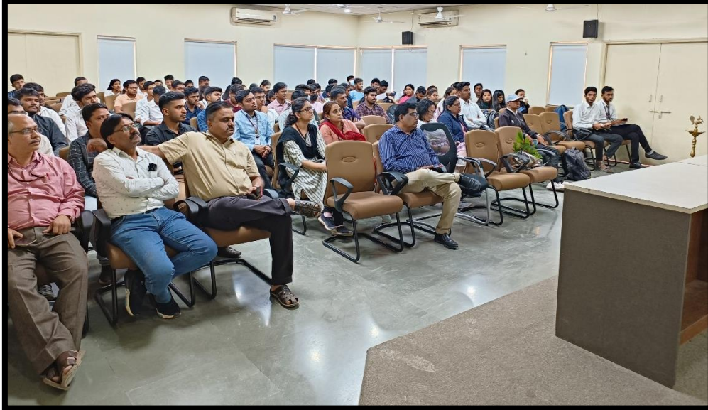
Faculties and students attending the lecture.

VISION:-Nurture the talent in Civil Engineers to work as global leaders for development of society.