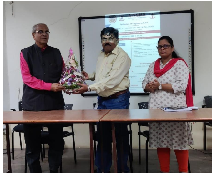
Felicitation of Er Saraf Sir