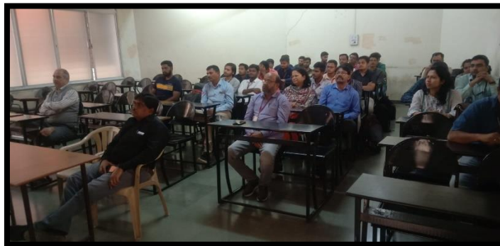
Faculties and students attending the lecture.