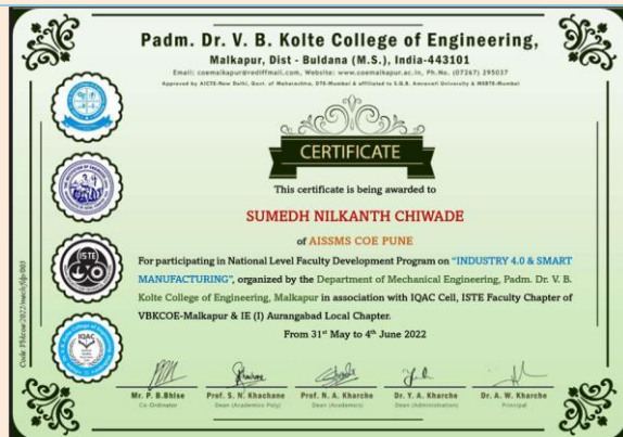
FDP attended by S N Chiwande on 31/05/2022 to 04/06/2022