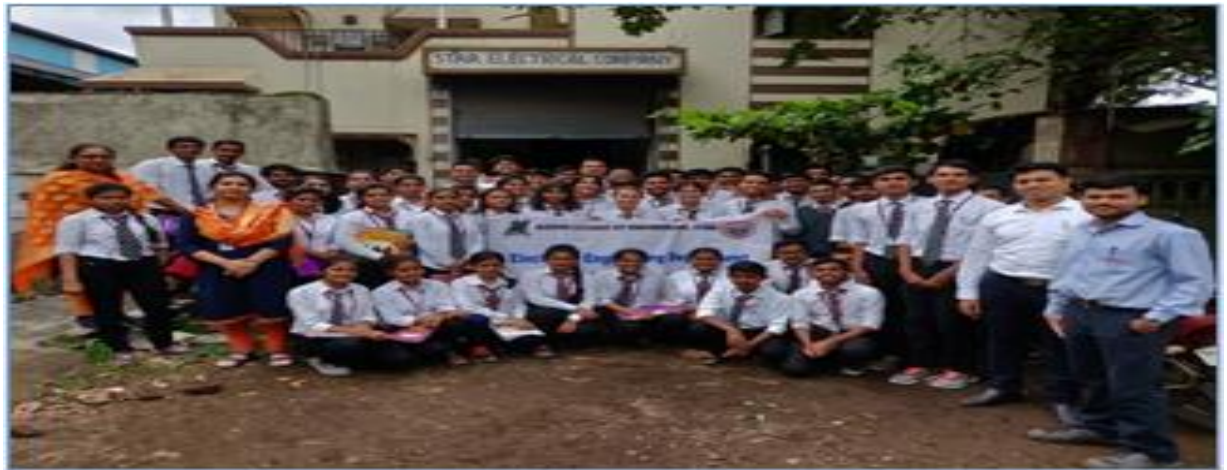
Industrial visit to S.E Electrical students to Star Electricals on 25/7/2019