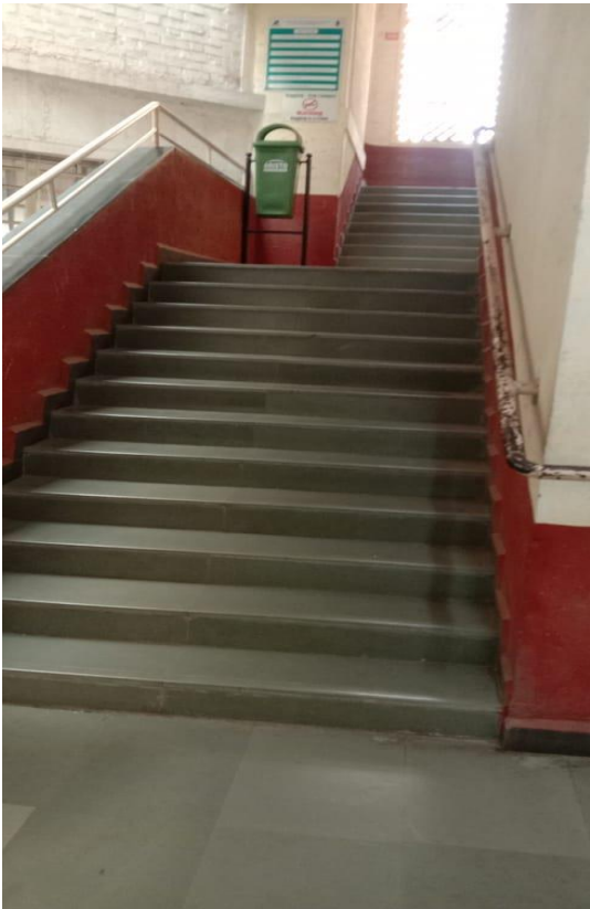
6. Railing in passages