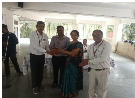
Social Activity at Pratibha Pawar Vidyalaya, Pune