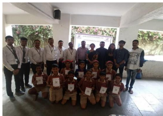
Social Activity by Production Engineering Students