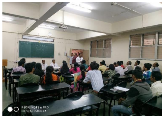
Faculty interacting with Parents