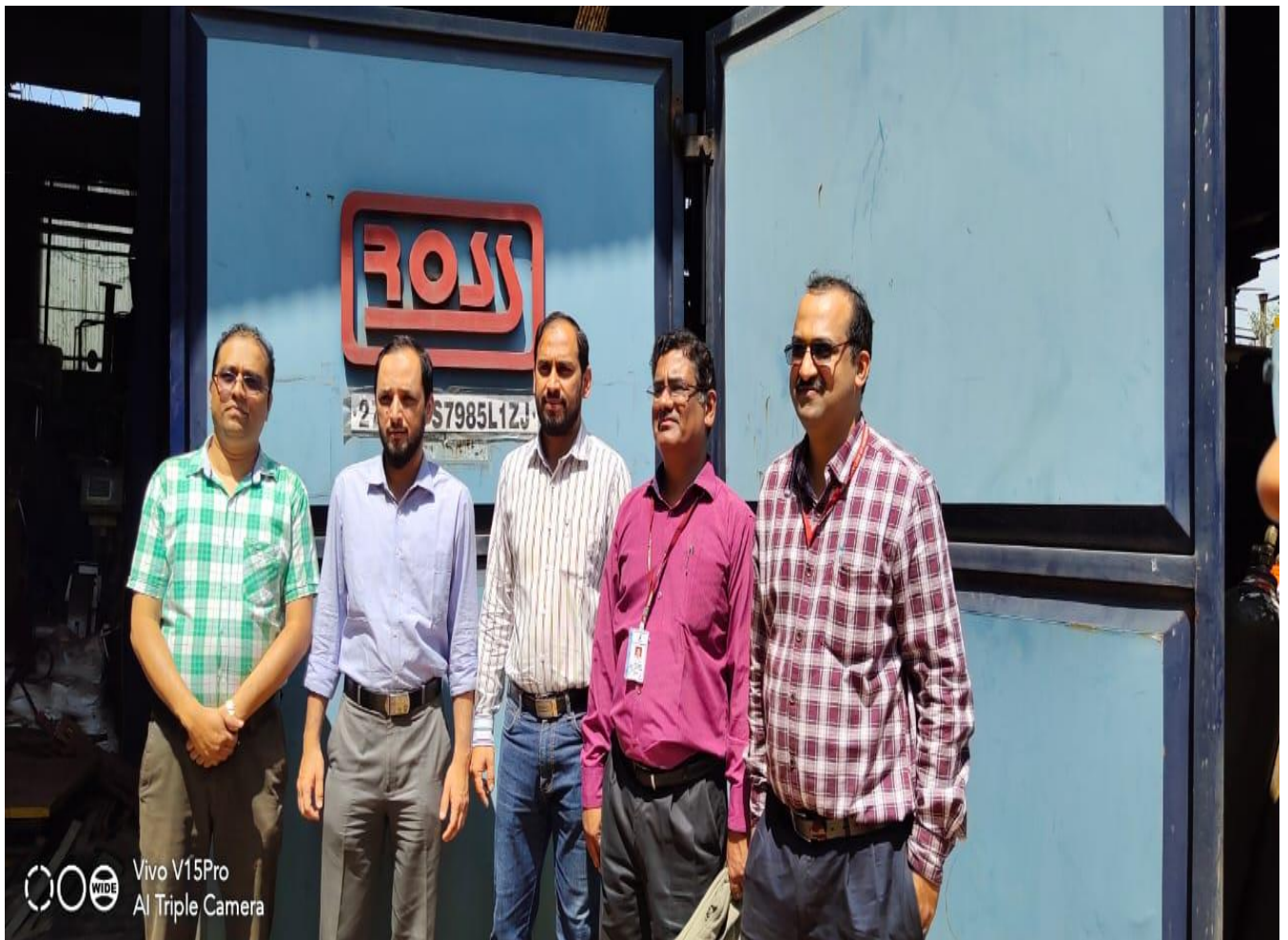
An Initiative by IQAC, AISSMS COE, PUNE