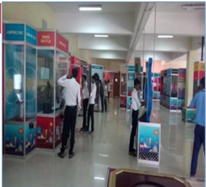
S.E. Electrical students to Science Park, Pimpri, on