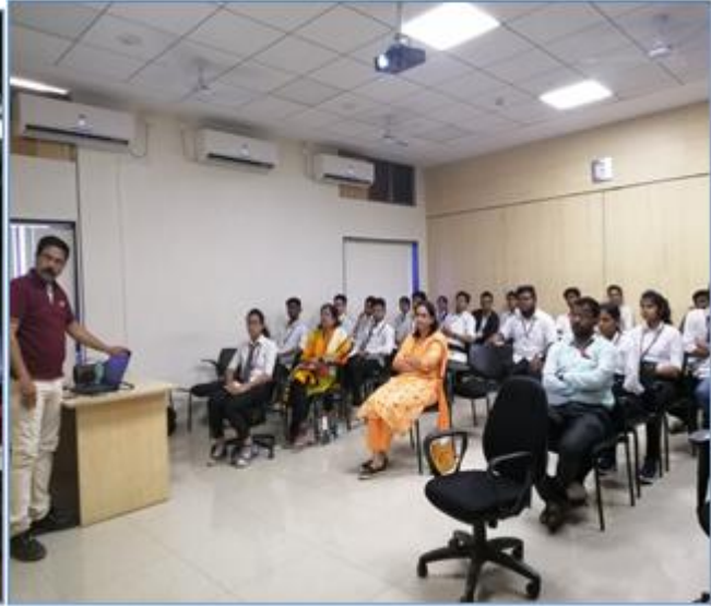
Industrial visit to S.E Electrical students to Star Electricals on 25/7/2019 and PARI robotics Shirwal 31/08/2019.