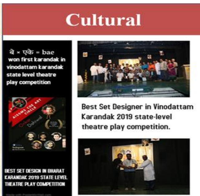
Cultural activity winner at Vinodattam Karandak. 11th September, 2019