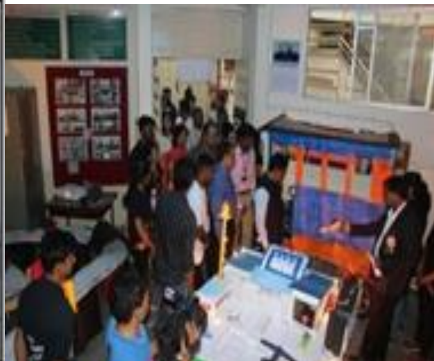
Engineering Today- Watts 2019 activities Aviated Fall and Science Exhibition