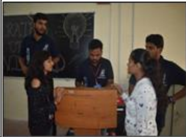
Engineering Today- Watts 2019 activities Laser War, Pirates Wizard