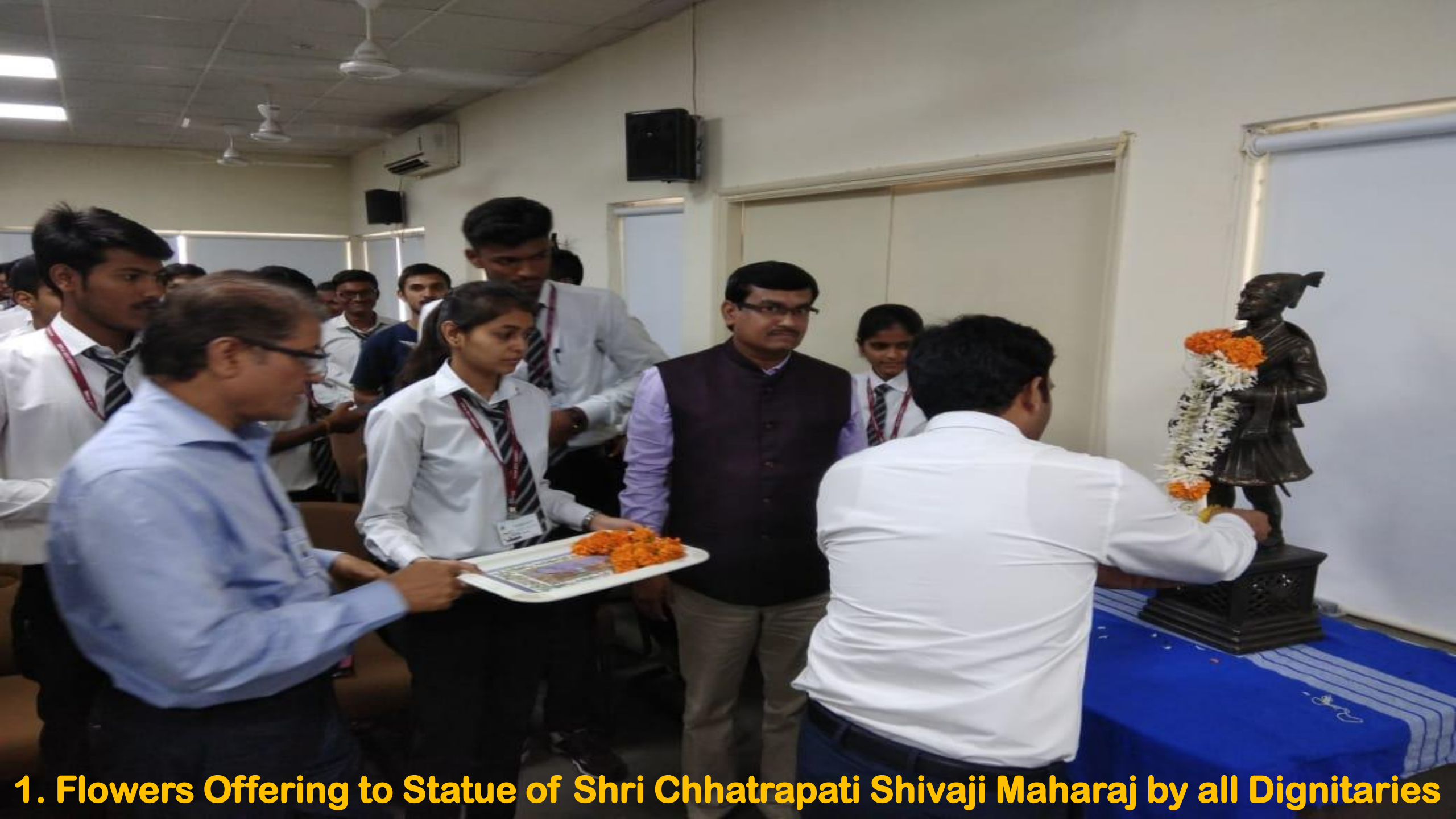
1. Flowers Offering to Statue of Shri Chhatrapati Shivaji Maharaj by all Dignitaries