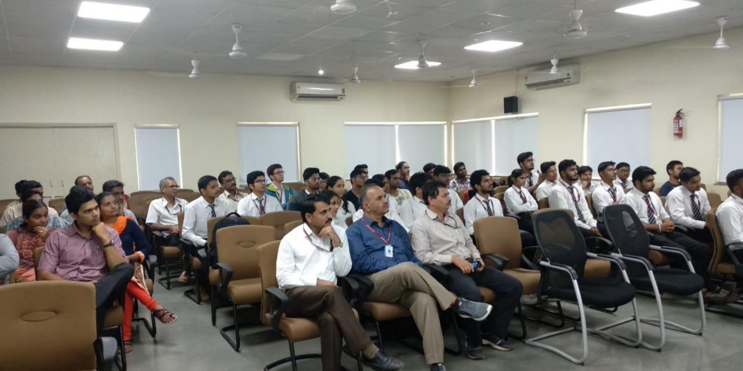
9. Staff of Mechanical Engineering Department and AISSMS ISHRAE student chapter members