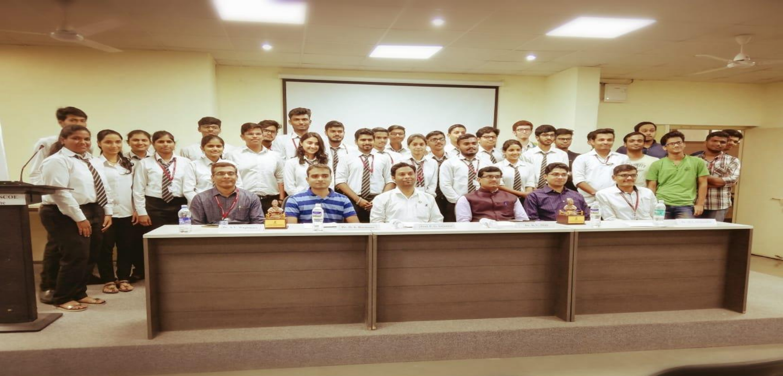
11. AISSMS ISHRAE student chapter team with ISHRAE Pune Chapter representatives