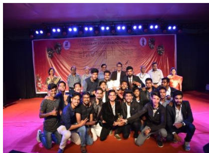
Winner: Cricket: Computer Dept.