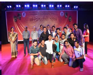
Winner: Basketball Civil dept.