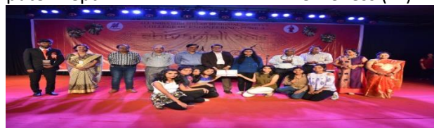
Winner: Football (W): Chemical Department