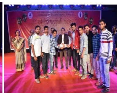
Winner: Volleyball Civil Dept