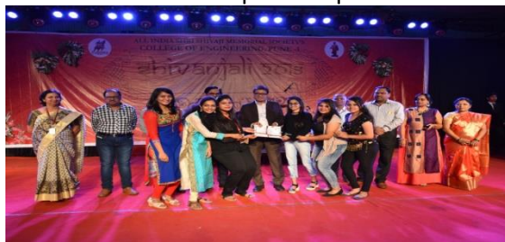
Winner: Basketball (W): Computer Dept