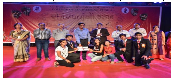
Winner: Chess (W): Electrical Dept