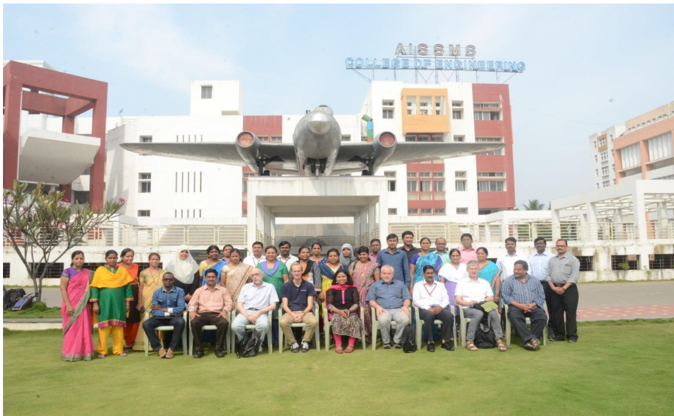
Participants International Workshop