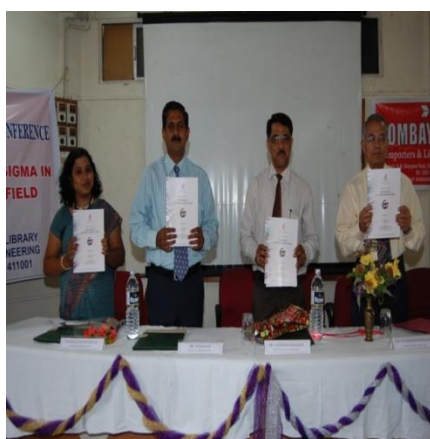
Releasing of Proceeding