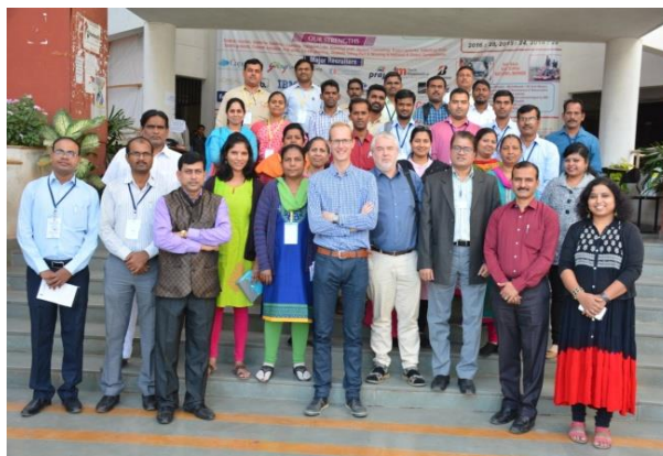
Participants with International Expert