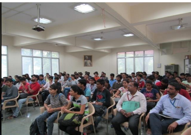
Participant students and Faculty