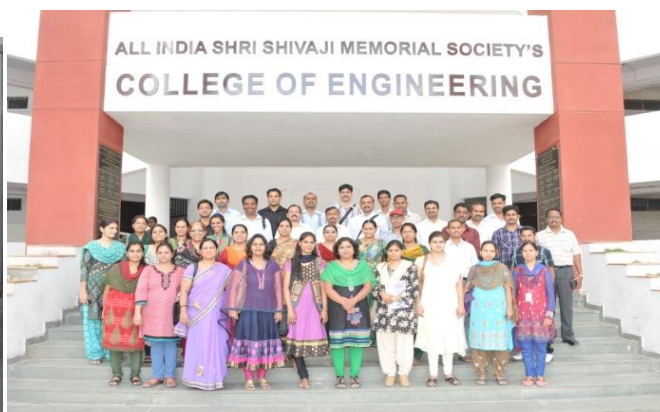
Delegates for the Conference