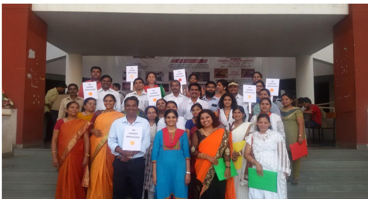
Participants of Getting to know more all about open access workshop