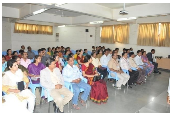
Conference in Process