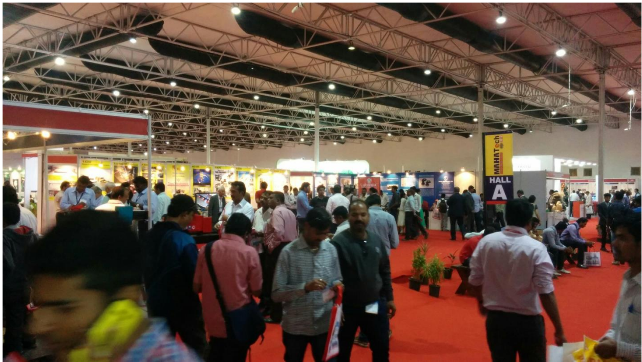
Engineering Product Stalls at MAMATECH-2017