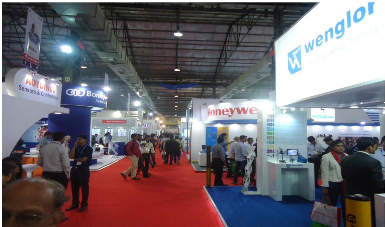
Students taking information on different Stalls during Technical Visit at Automation-2016