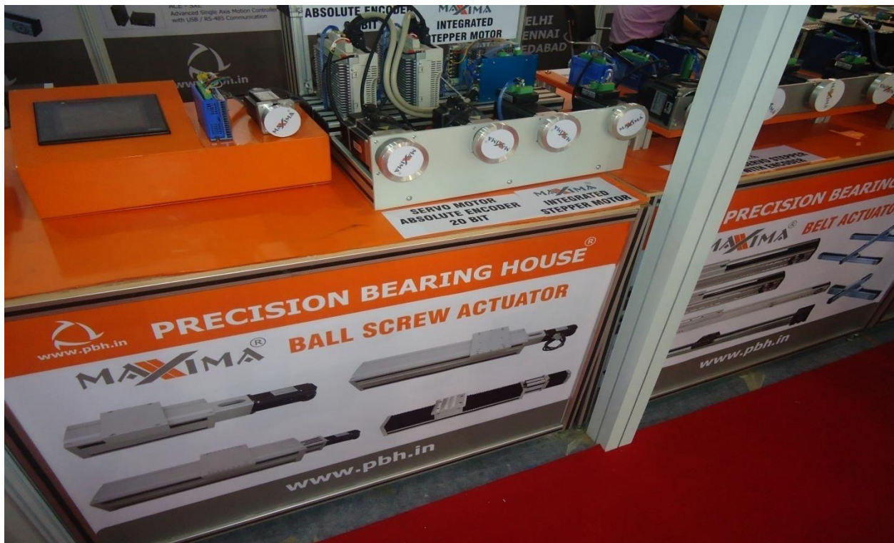
Stall during Technical Visit at Automation-2016