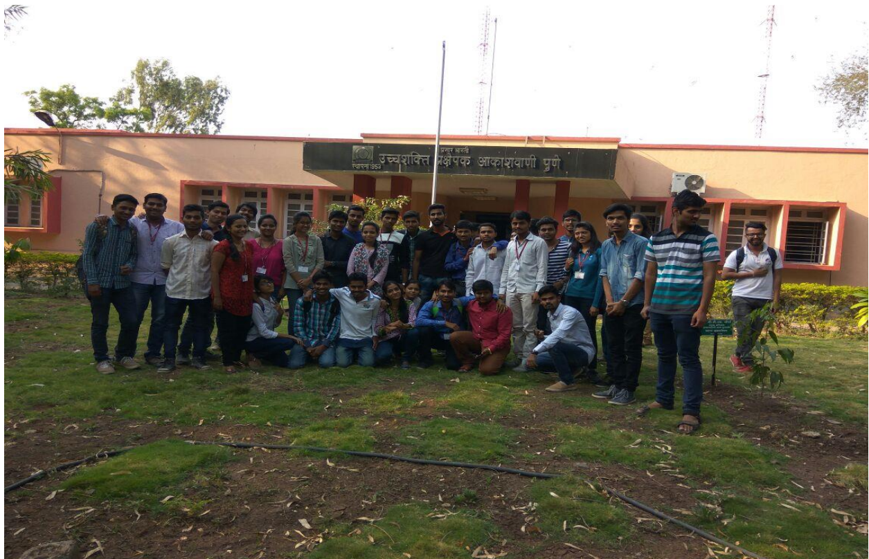
SE Electronics Students during Technical visit at HPT-HADAPSAR, AIR, Pune