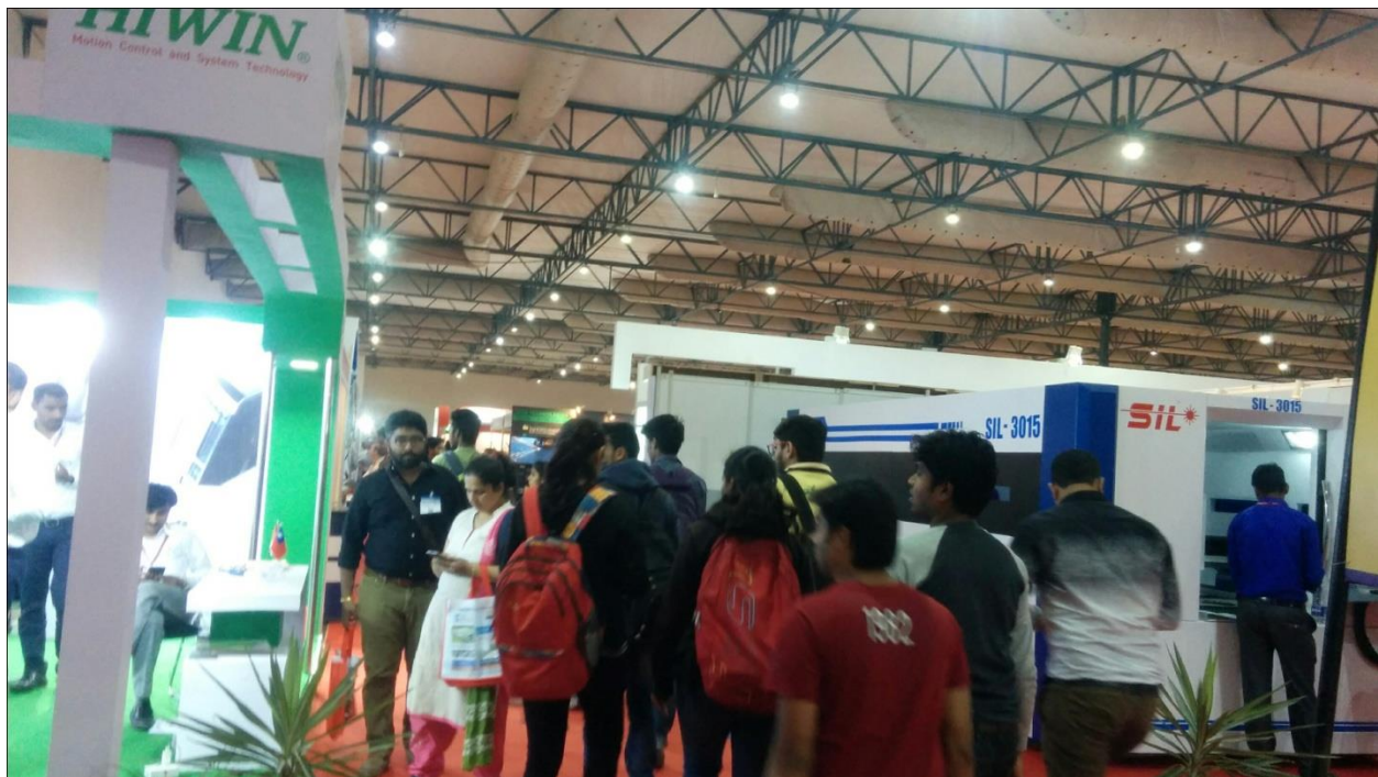
Students visited Engineering Product Stalls at MAMATECH-2017