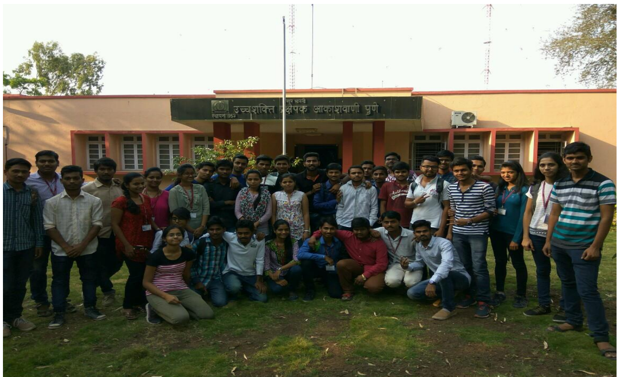
SE Electronics Students during Technical visit at HPT-HADAPSAR, AIR, Pune