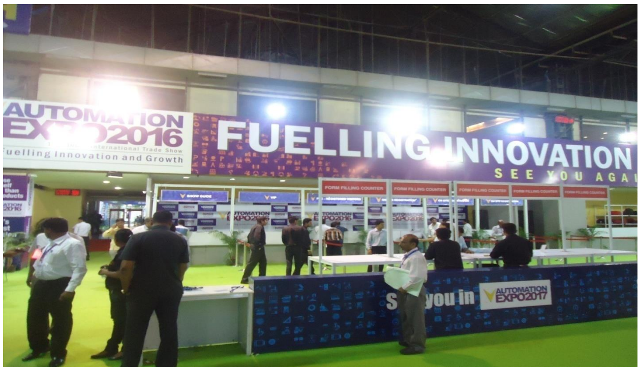
Registration Desk Automation Expo – 2016