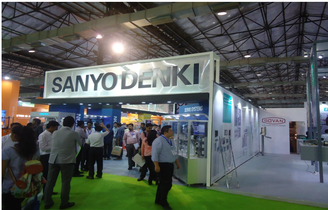
Students visited Stall during Technical Visit at Automation-2016