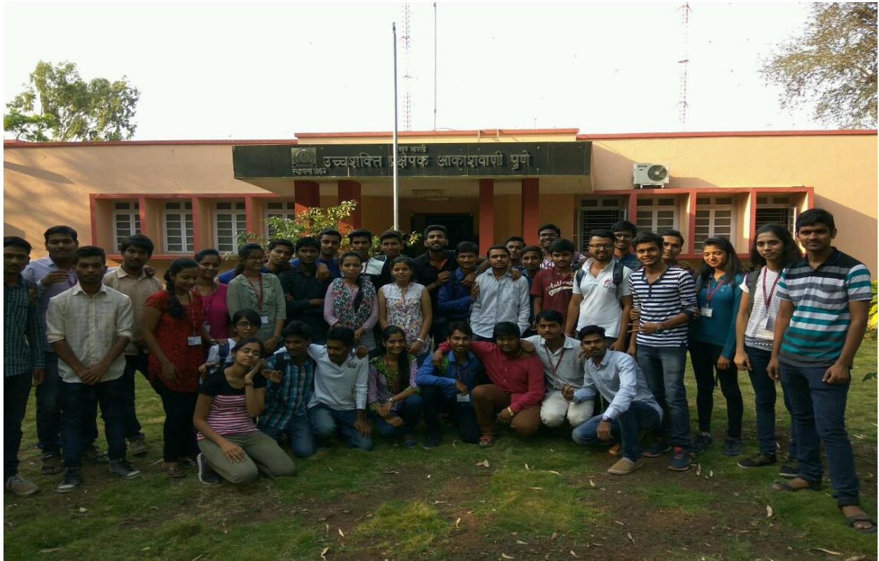
SE Electronics Students during Technical visit at HPT-HADAPSAR, AIR, Pune