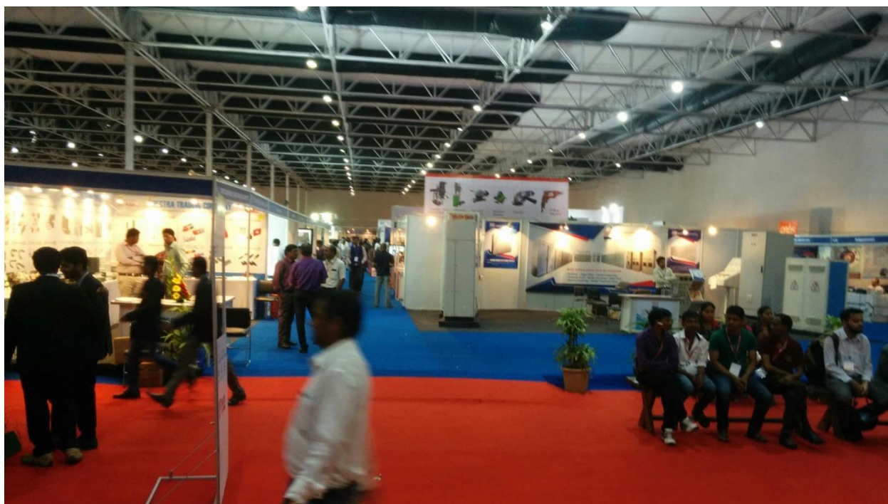
Engineering Product Stalls at MAMATECH-2017