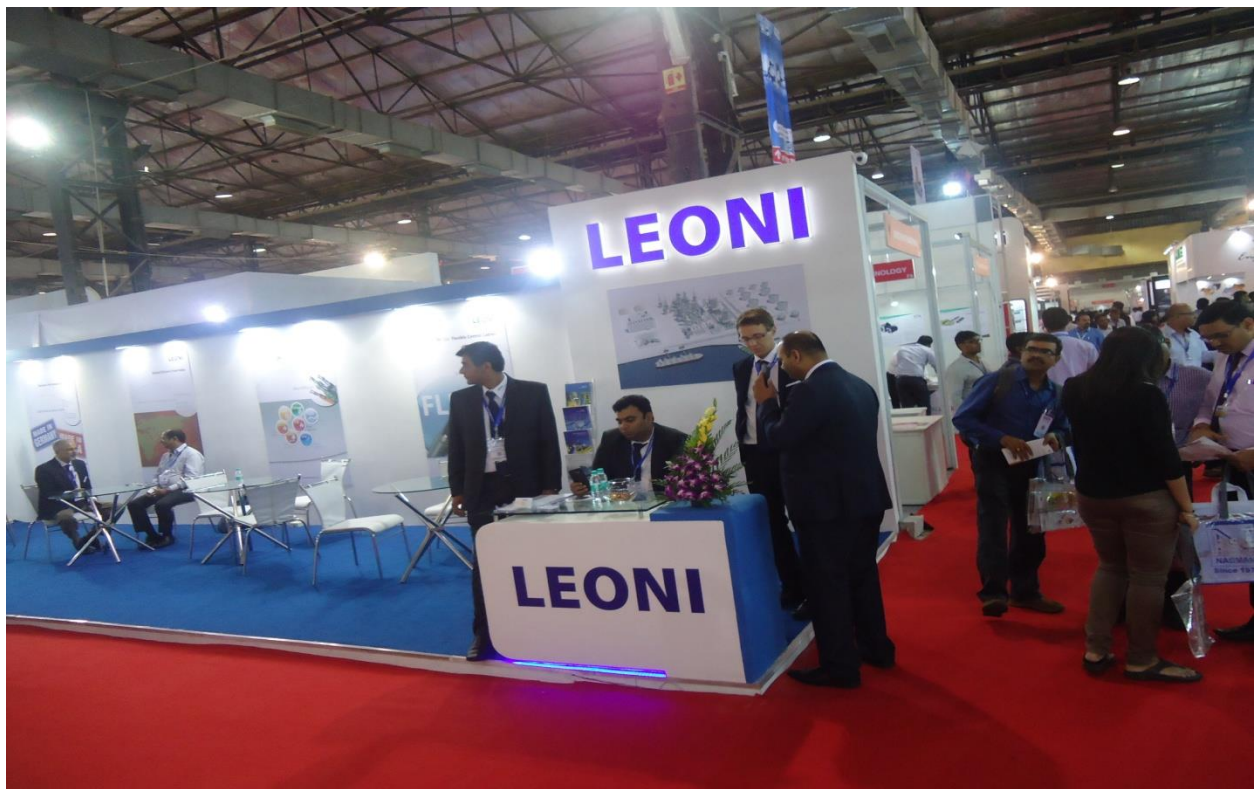
Students visited Stall during Technical Visit at Automation-2016