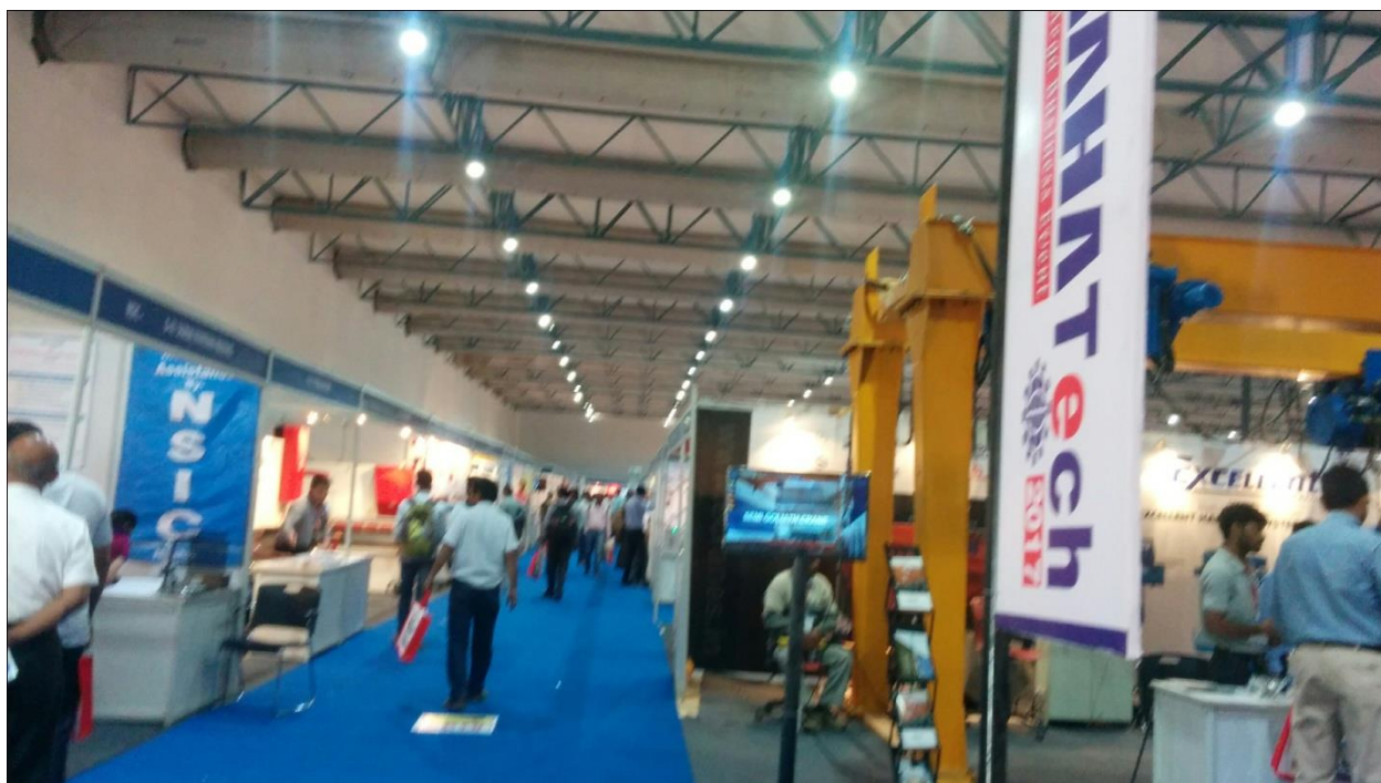
Engineering Product Stalls at MAMATECH-2017