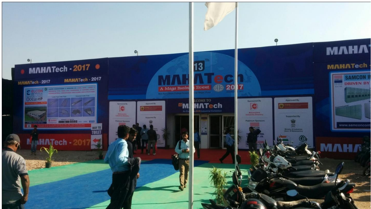
Entrance of MAHATECH-2017