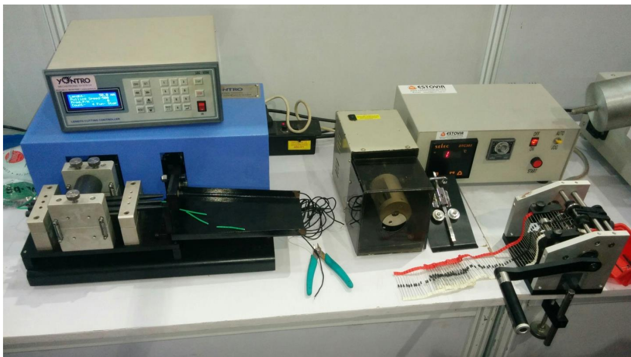
Engineering Product Stalls at MAMATECH-2017