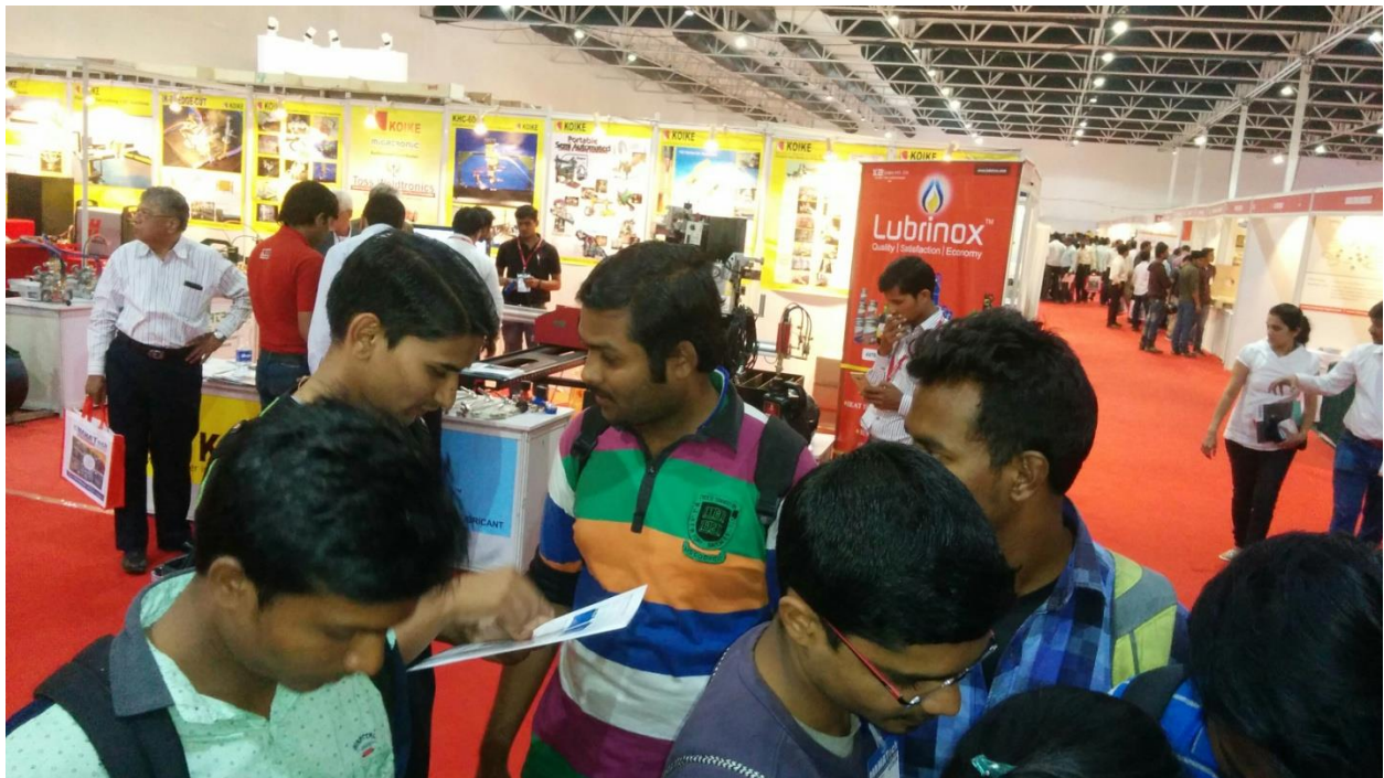
Engineering Product Stalls at MAMATECH-2017