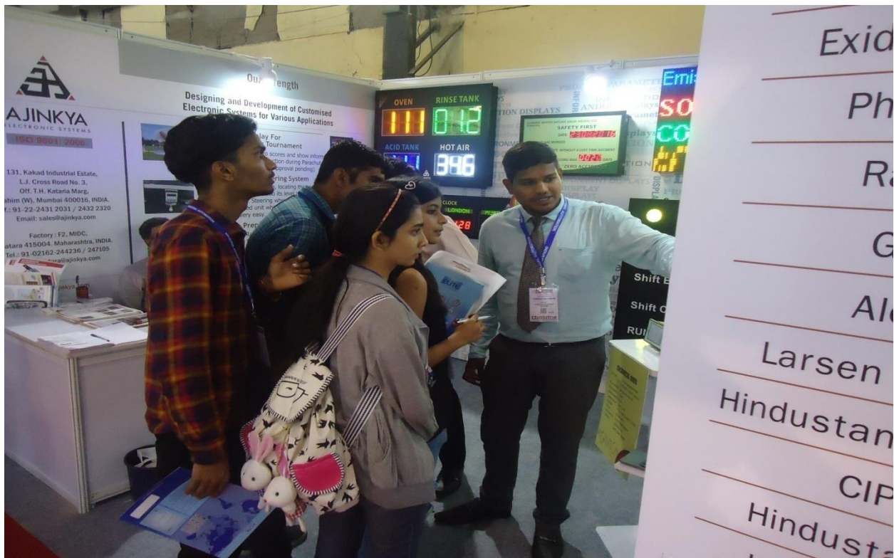
Students taking information on Stall during Technical Visit at Automation-2016