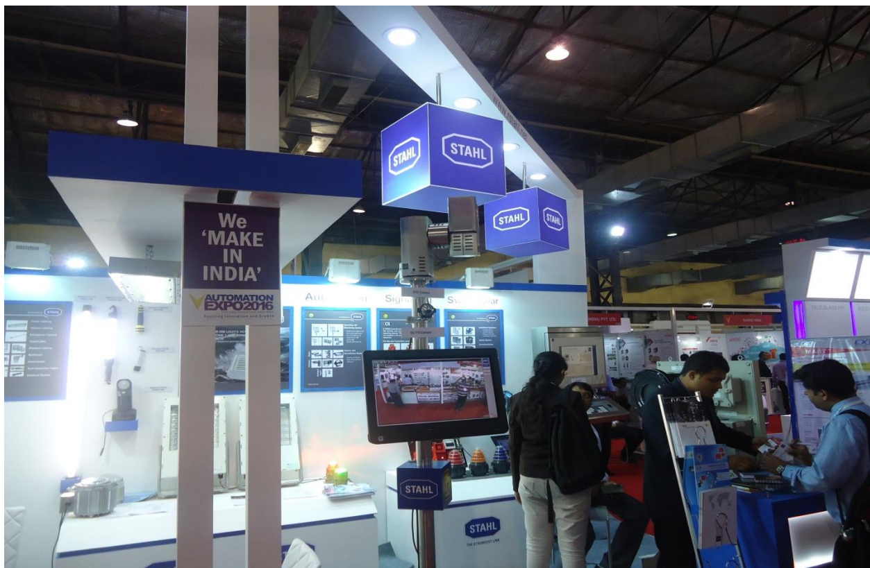
Stall during Technical Visit at Automation-2016