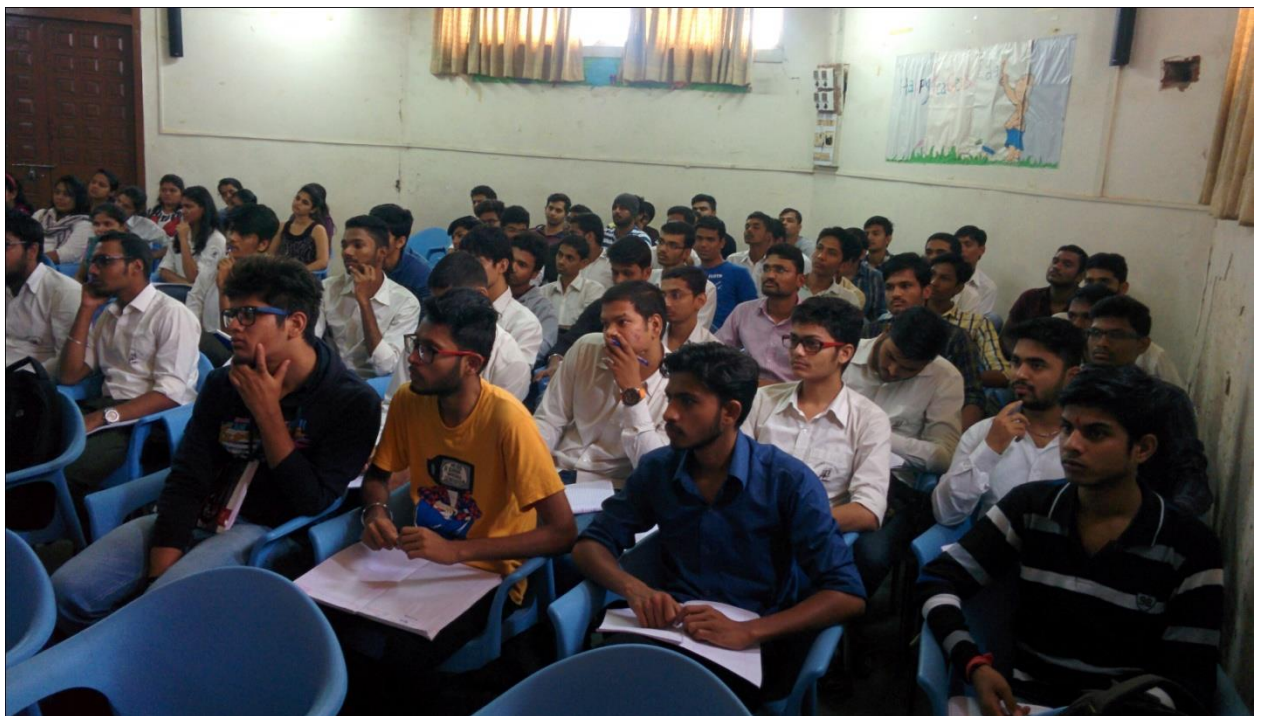
Audience for Seminar on ESD