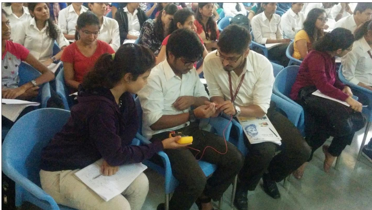
Hands on Session given to Students