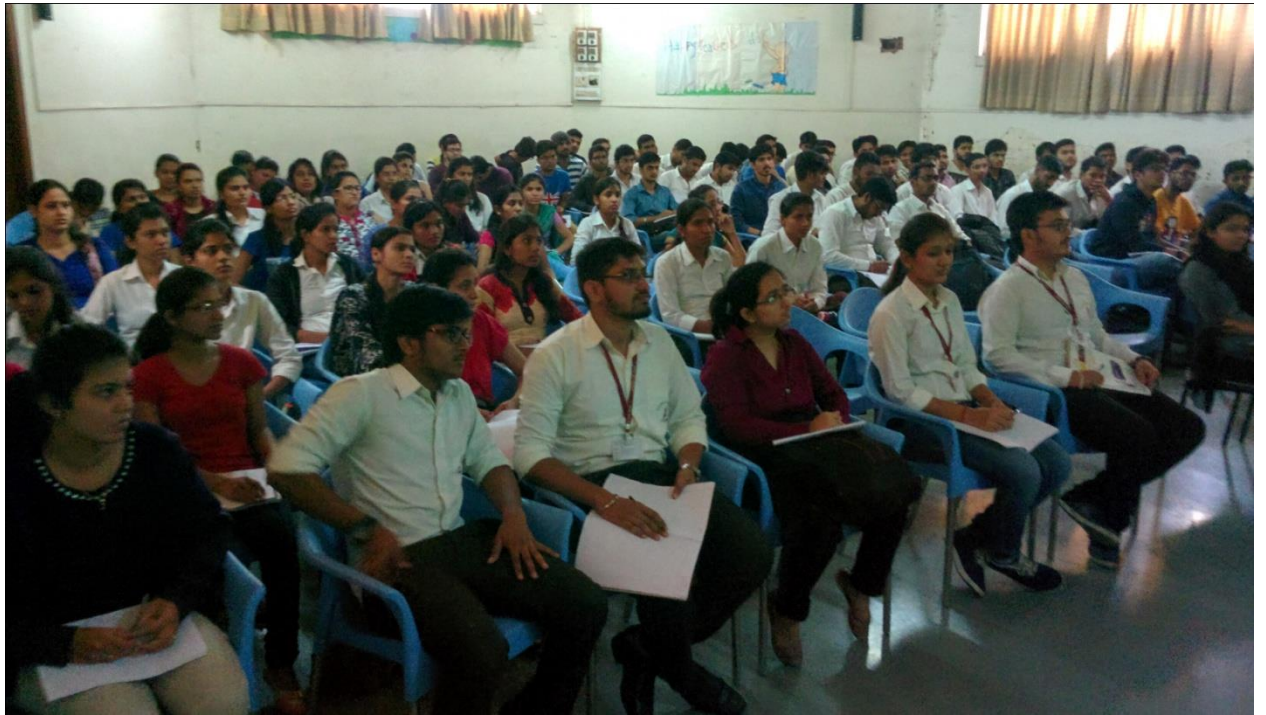
Audience for Seminar on ESD