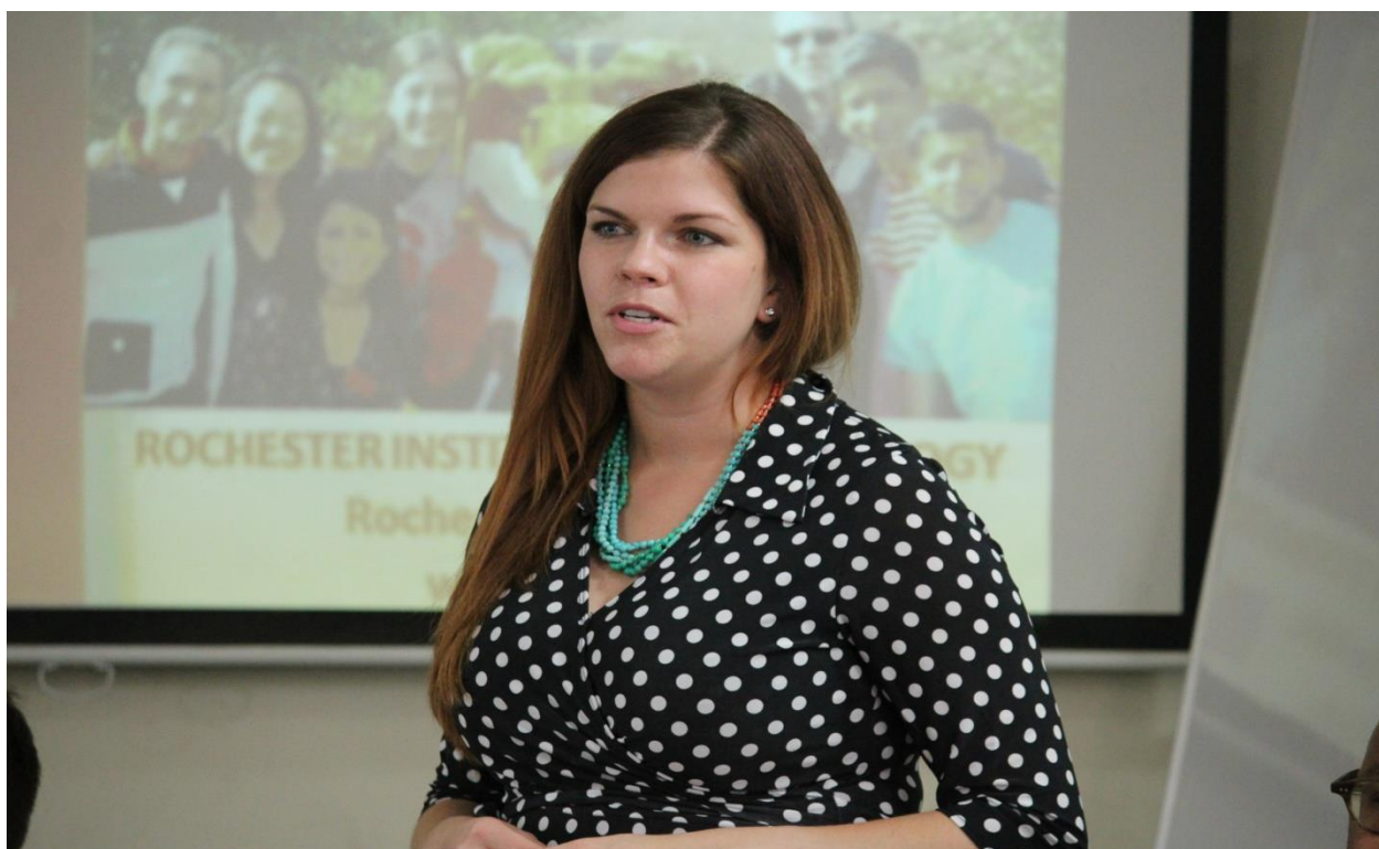
US Universities Representative explaining about MS Opportunities