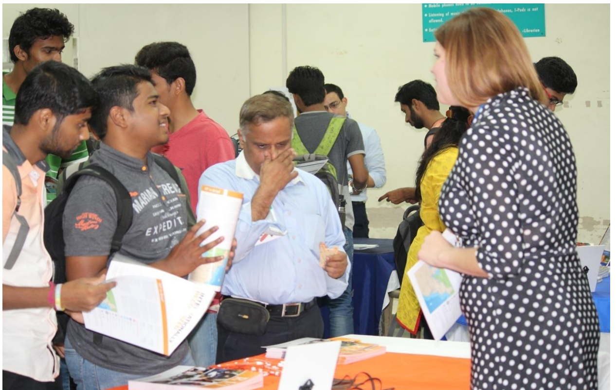
Students and Faculties interacting about US Universities and Admissions