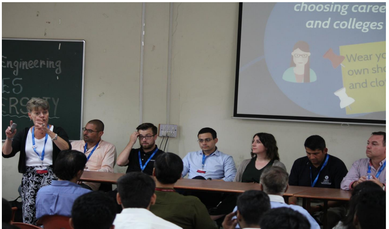
Seminar on MS preparation and US Universities Interaction is in progress