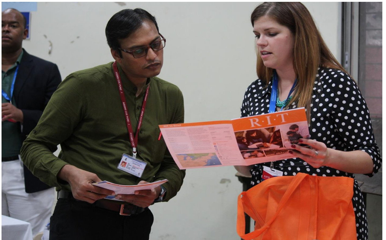
Faculty interacting about RIT US University and Admissions procedure