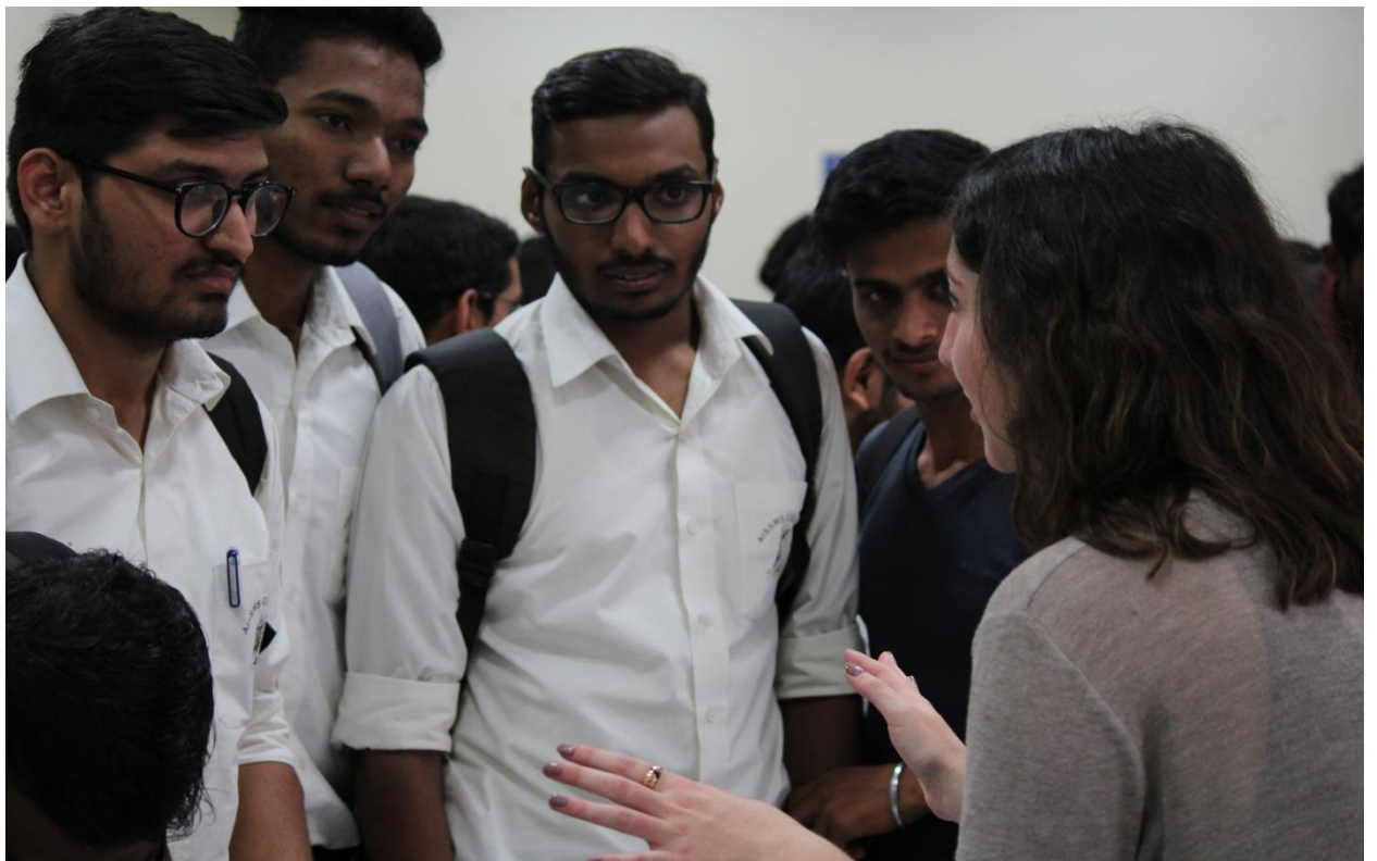
Students interacting about US Universities and Admissions