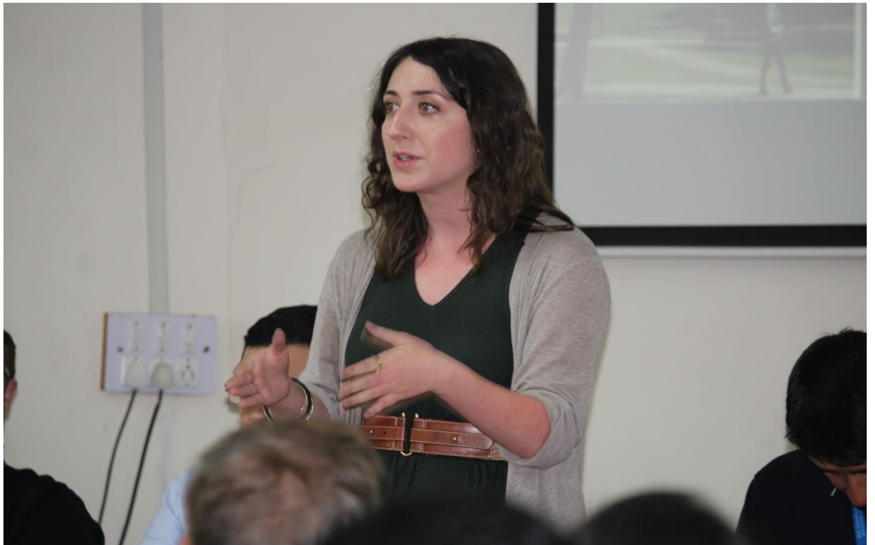
US Universities Representative explaining about MS Opportunities