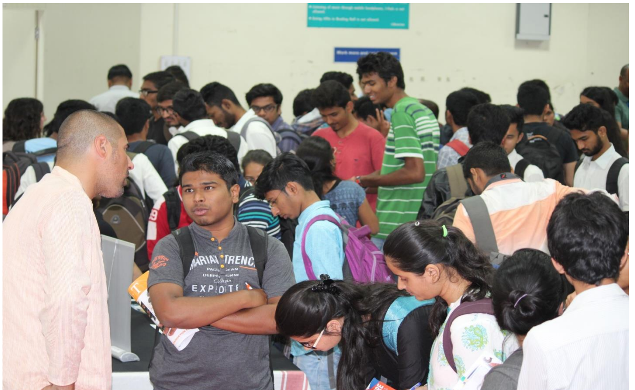
Students interacting about US Universities and Admission procedure