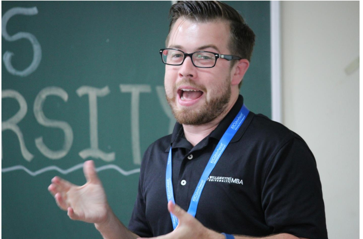
US Universities Representative explaining about MS Opportunities