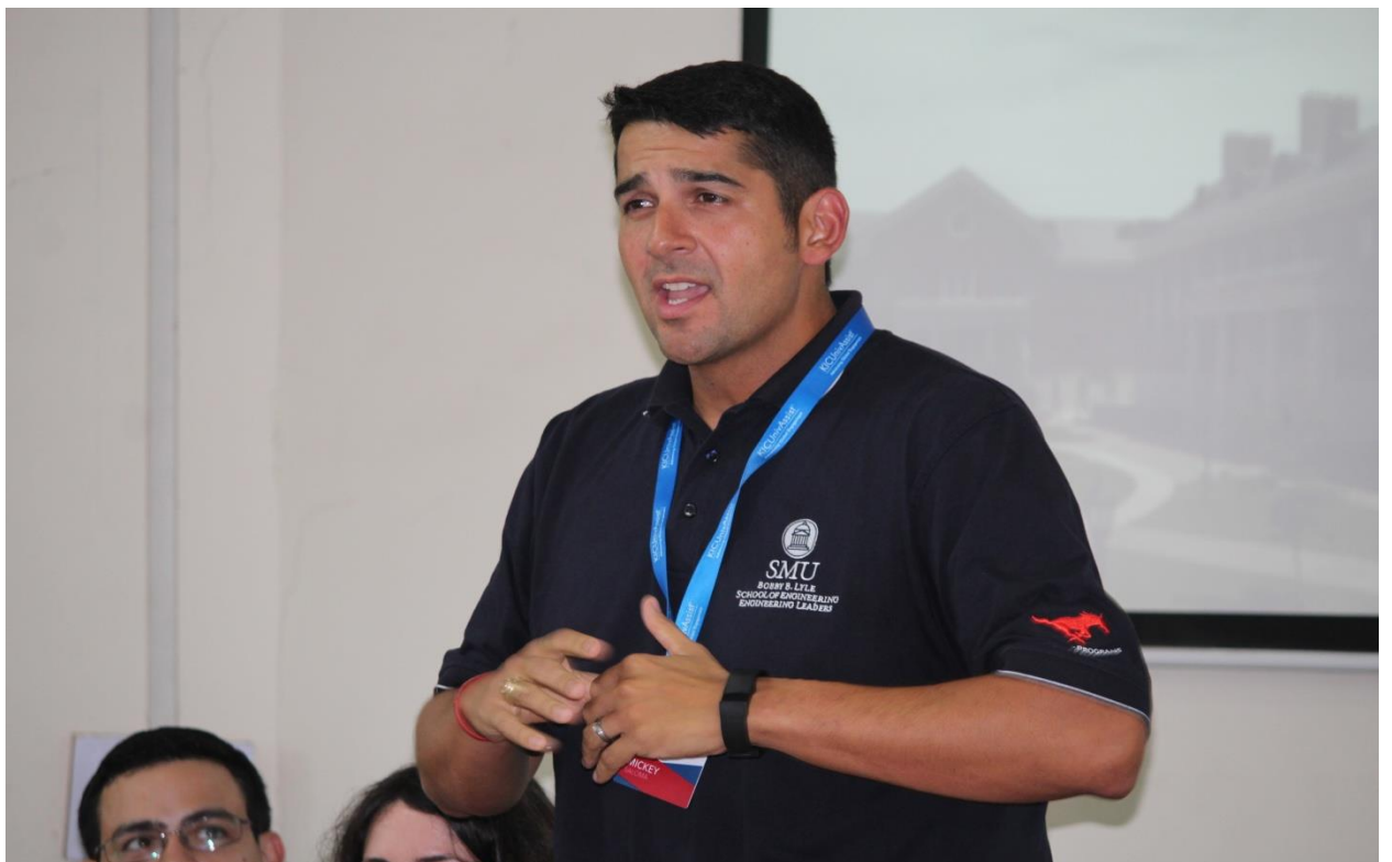
US Universities Representative explaining about MS Opportunities