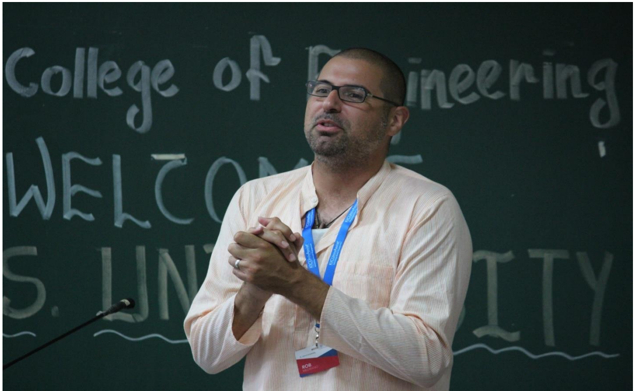
US Universities Representative explaining about MS Opportunities