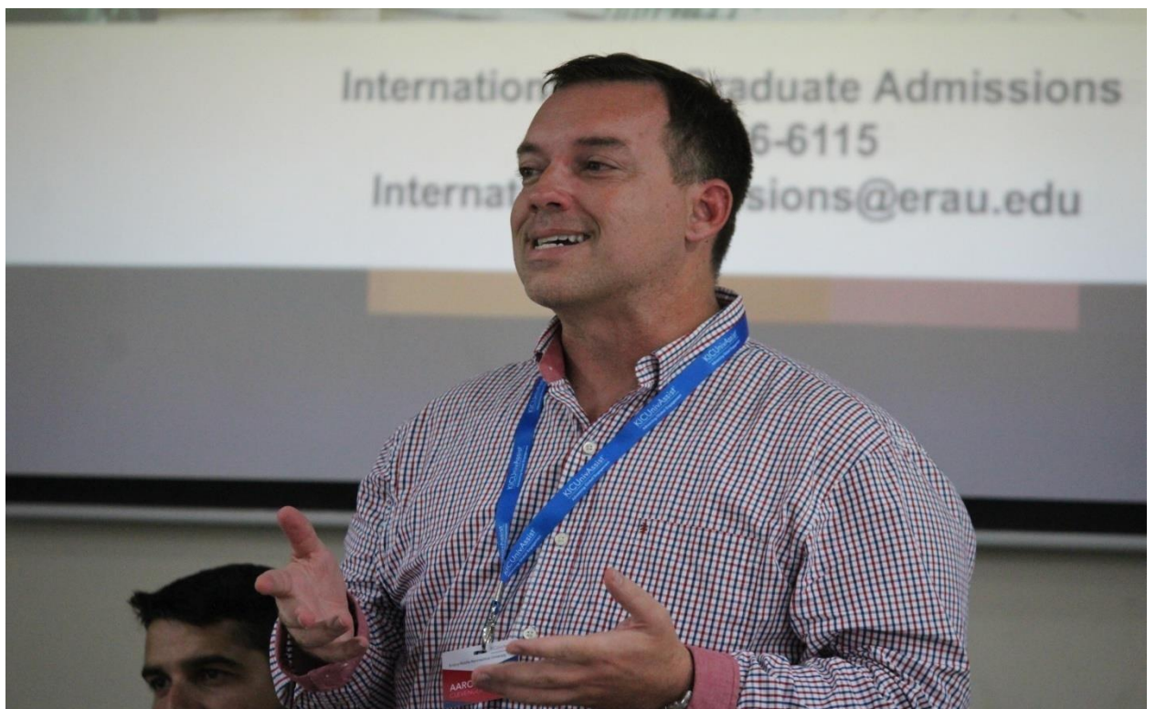
US Universities Representative explaining about MS Opportunities