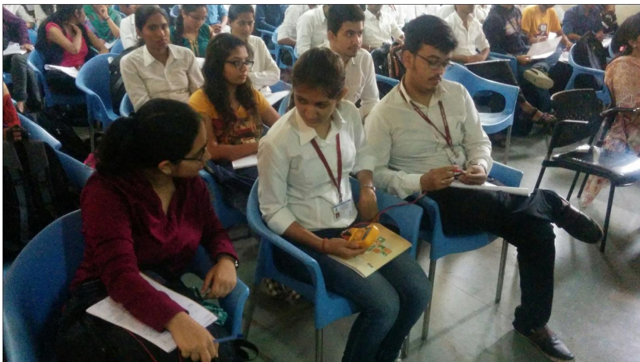
Hands on Session given to Students