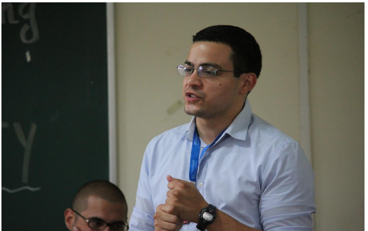
US Universities Representative explaining about MS Opportunities