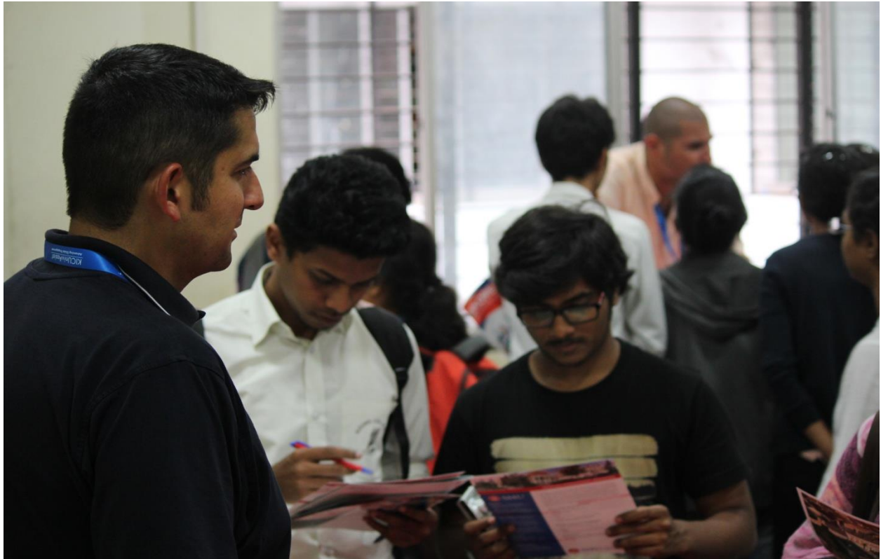
Students interacting about US Universities and Admissions