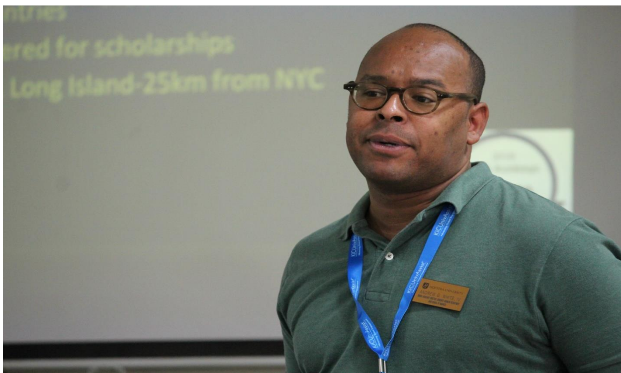
US Universities Representative explaining about MS Opportunities