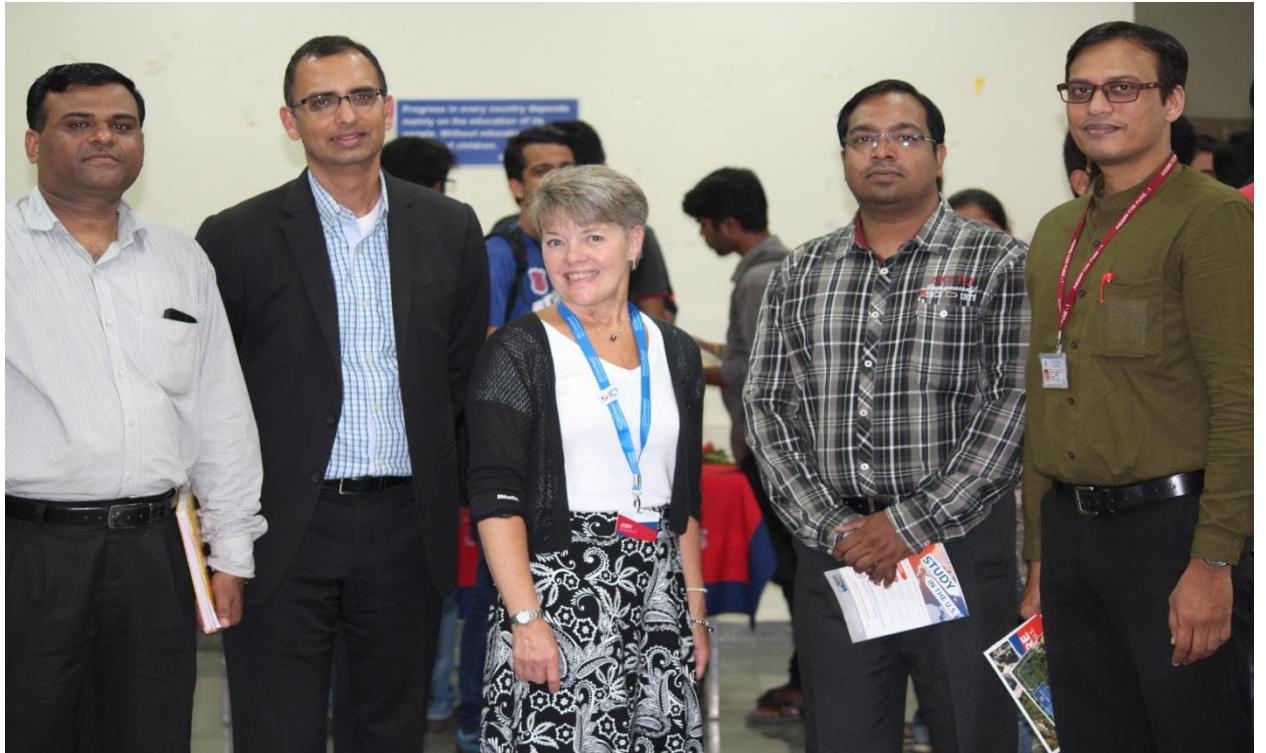
Faculties with US Universities representatives