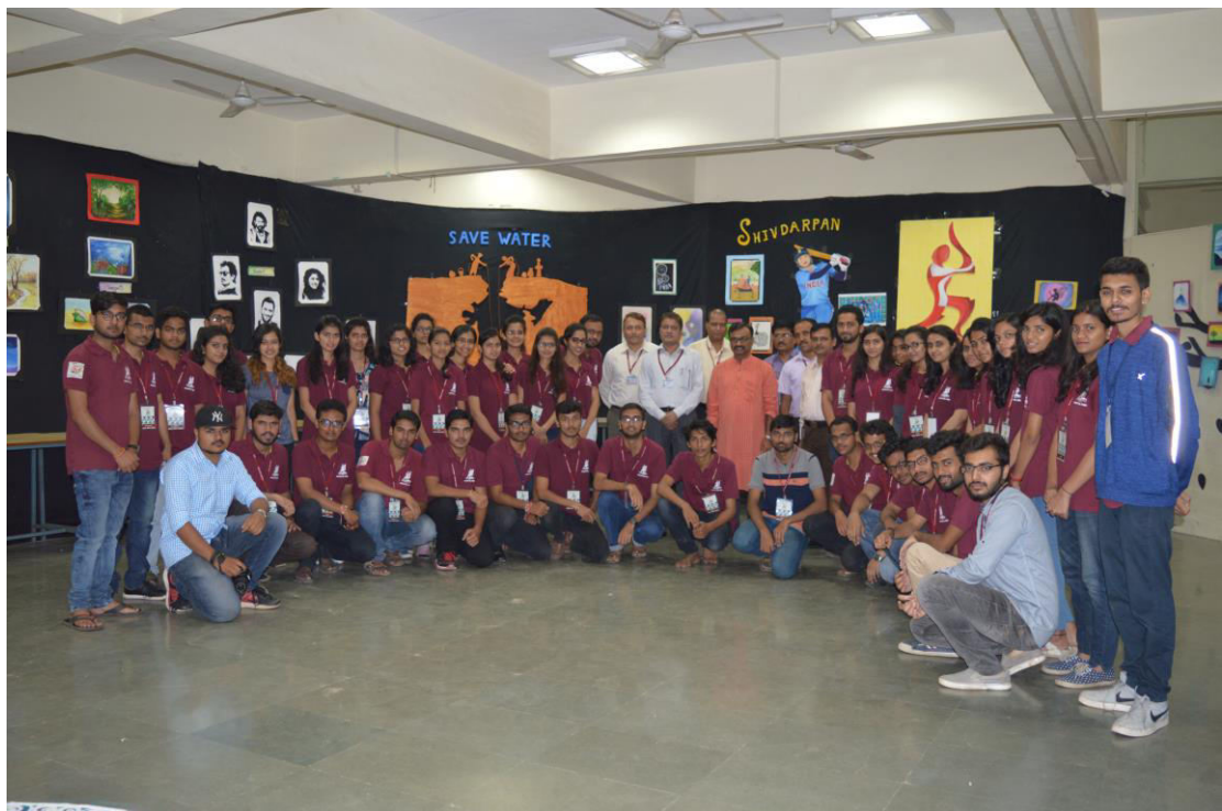
Shivdarpan Committee 2017-18