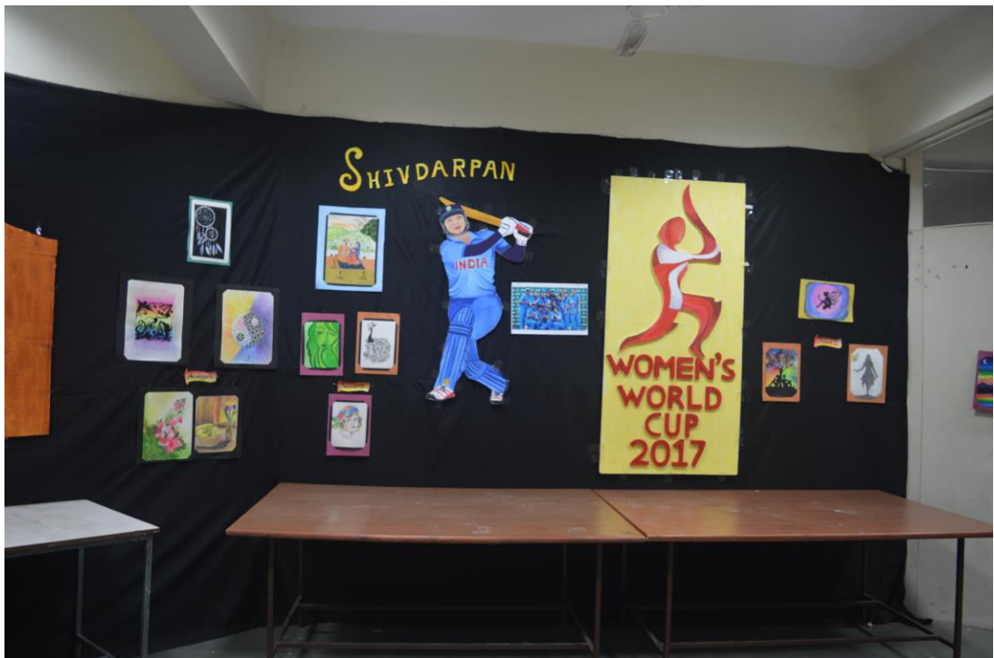
Women's World Cup Theme