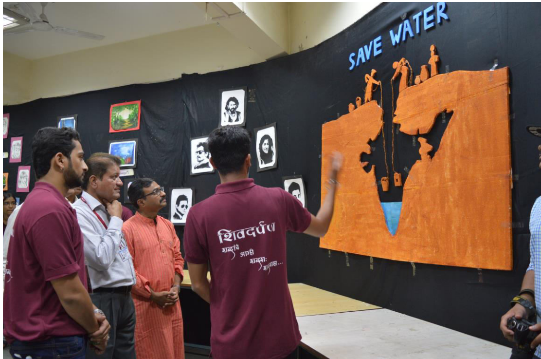
Save Water Theme