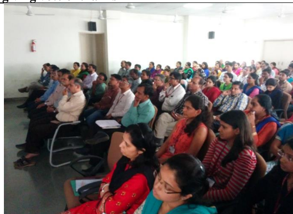
Participants for Seminar on Awareness Program on Digital Payment Methods