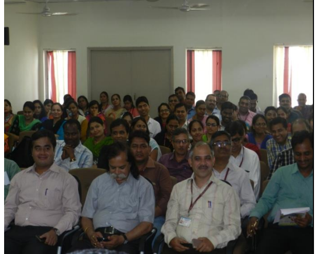
Participants for Seminar on Awareness Program on Digital Payment Methods